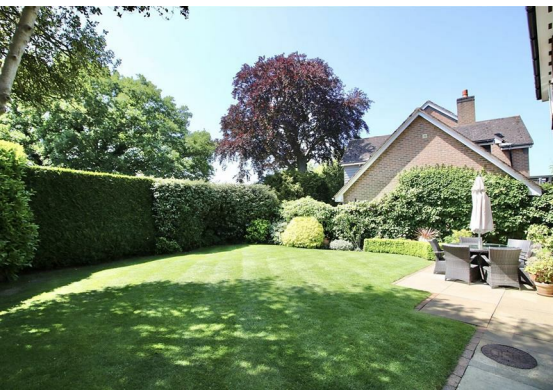
REAR GARDEN 42' x 50'0 (12.80m x 15.24m)