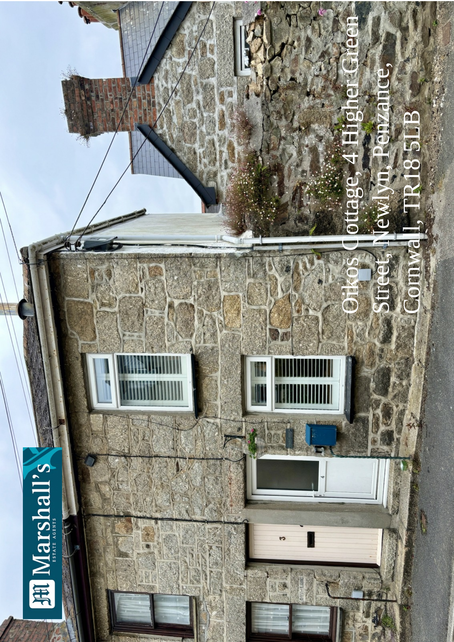
Oikos Cottage, 4 Higher Green Street, Newlyn, Penzance, Cornwall, TR18 5LB