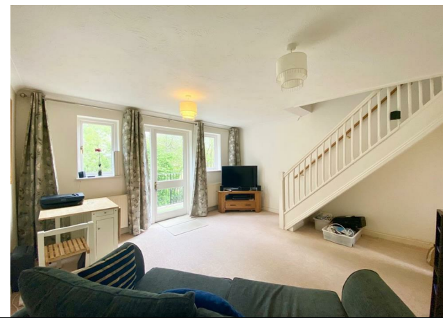
1 Alice Mews Dapps Hill, Keynsham ,