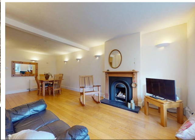
Lansdown View, Bath , BA2 0JP