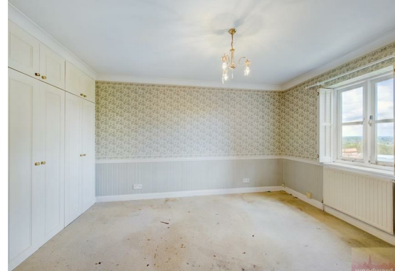
Bedroom 1 9'9" x 12'2" (2.98 x 3.71)