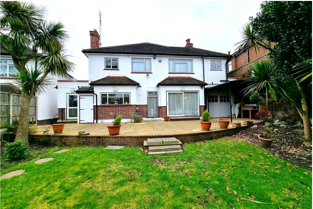
COVERED BBQ AREA & ACCESS TO GARAGE FROM REAR: Also Access to Garage.