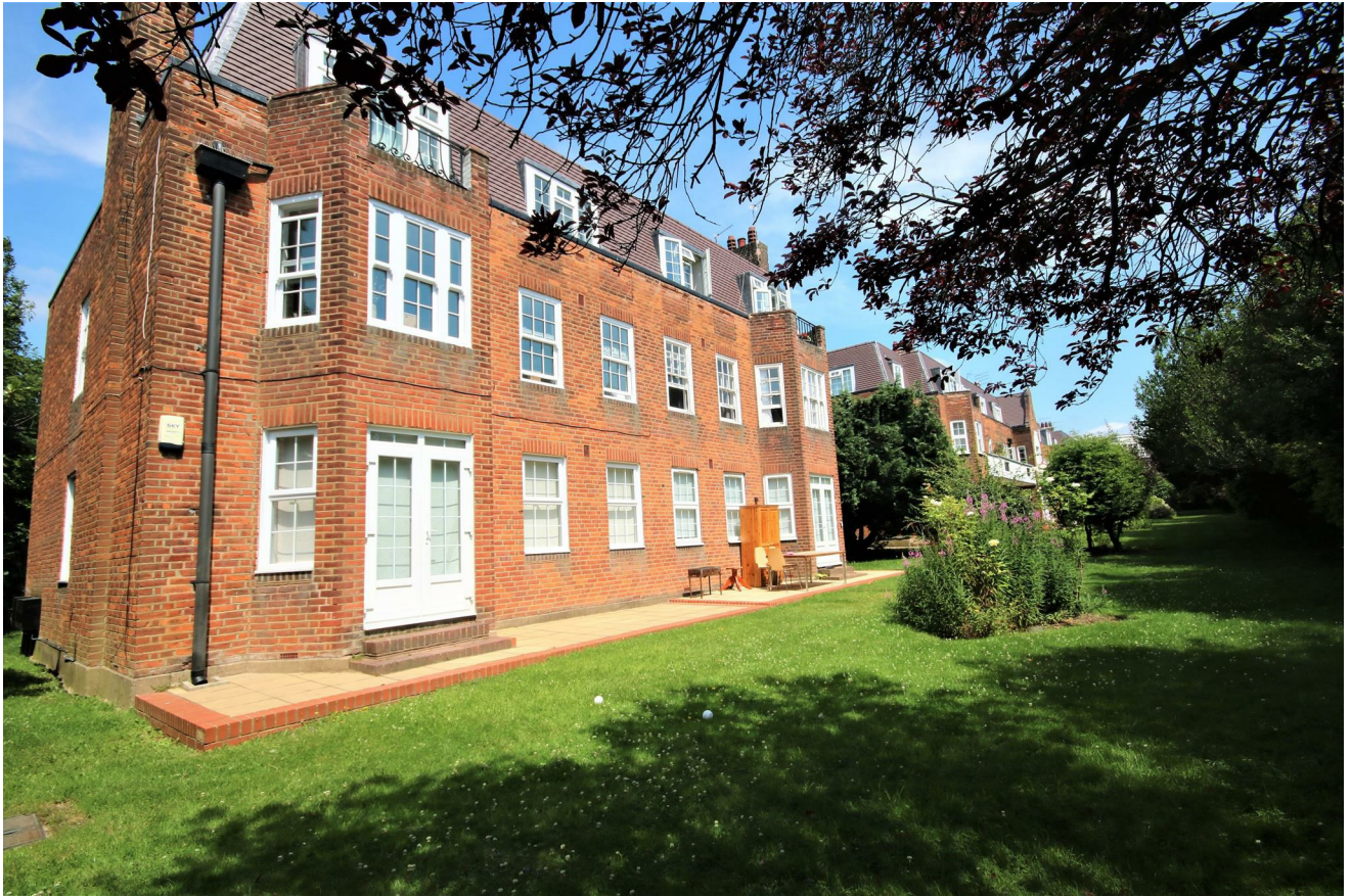
FRONT OF BLOCK: