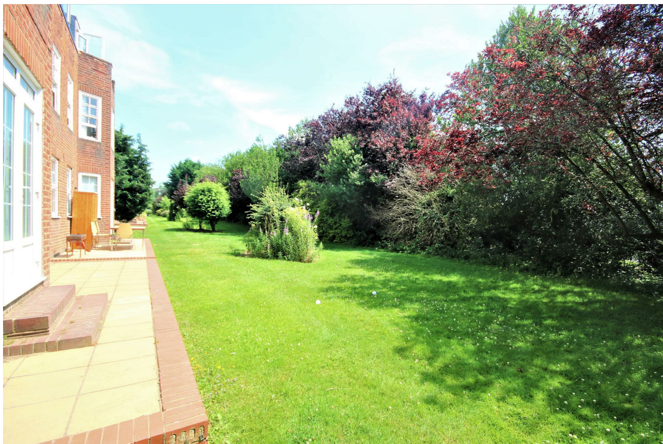
REAR ELEVATION OF PROPERTY & PAVED PATIO AREA: Very Useful Area Suitable for Garden Table & Chairs. Sunny Aspect.

Well Maintained Communal Gardens, Mainly Laid to Lawn and Well Screened from Mount Pleasant with Mature Trees & Shrubs.