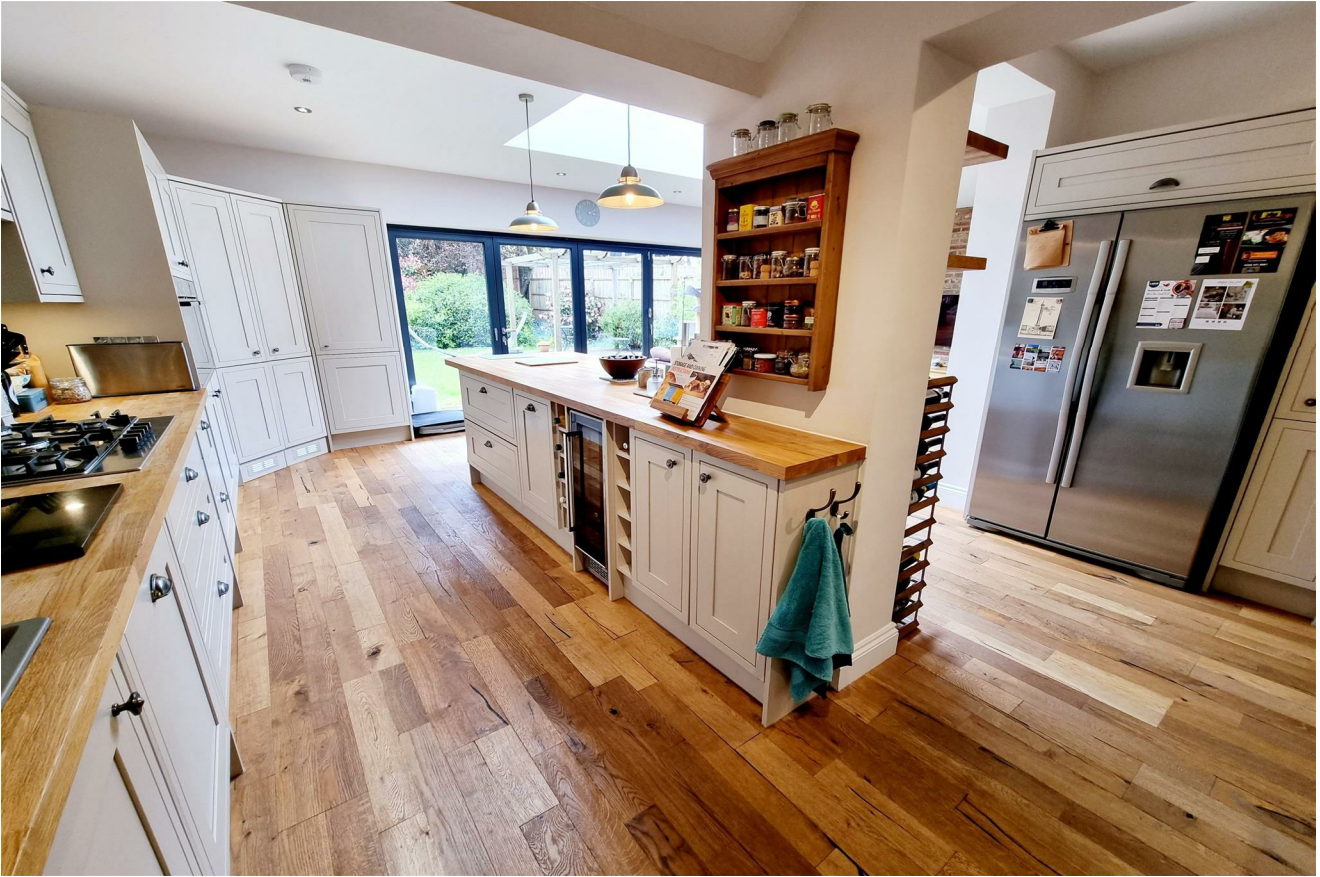
LUXURY FITTED KITCHEN/DINER : PIC 2 Showing the Large Breakfast Bar for 6 People.

Very Spacious and Well Fitted with Ample Floor & Wall Units. 1.5 Inset Sink with Mixer Taps, 5 Ring Gas Ring, Eye Level Double Oven. Integrated Fridge/Freezer, Integrated Dishwasher, Large Breakfast Bar with Units Beneath. French Doors to Garden + Large Double Glazed Window to Side. Large Radiator. Karndeal Flooring.