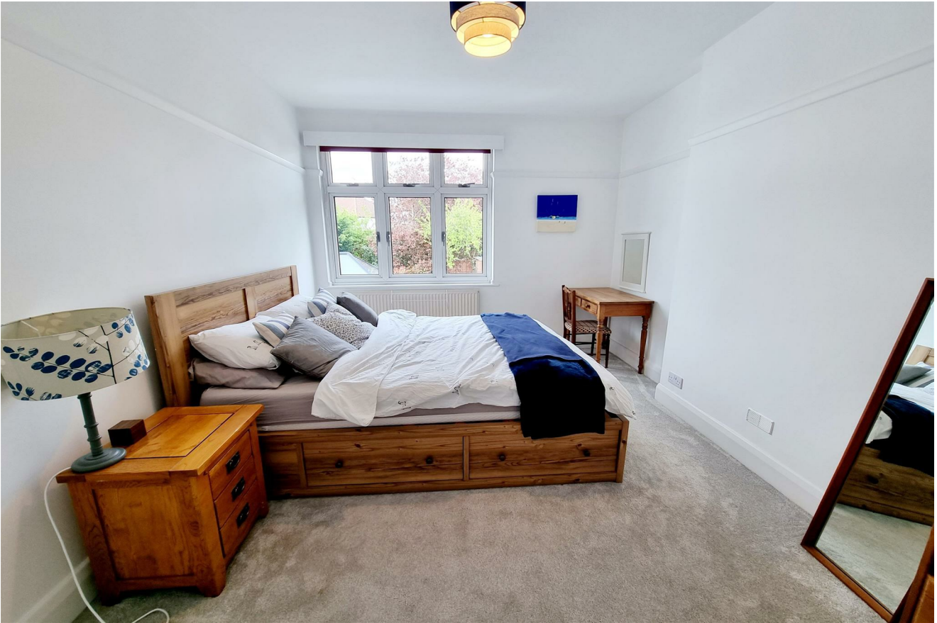
BEDROOM 3: 11'2 x 8'1 (3.40m x 2.46m) Double Glazed Window to Rear, Fitted Carpet, Picture Rail, Radiator.