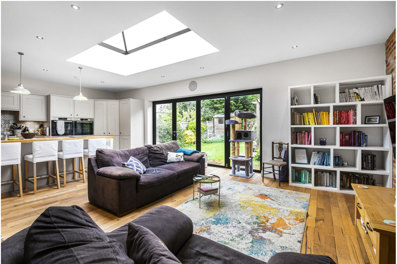
EXTENDED REAR RECEPTION ROOM WITH SKYLIGHT: PIC. 2 Different Aspect Showing Brick Wall Feature.

EXTENDED REAR RECEPTION ROOM WITH SKYLIGHT: PIC. 1 29' x 26'3 (inclusive) (8.84m x 8.00m (inclusive)) A Beautiful Addition to this Stunning Property with 1 x Whole Brick Wall Feature and Double Glazed Skylight. Open Plan to Luxury Fitted Kitchen/Diner. Bi-Folding Double Glazed Doors to Garden.