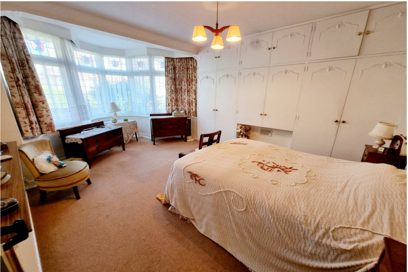
BEDROOM 2: 16'9 x 12'7 (5.11m x 3.84m) Unusually Wide Double Glazed Window to Front, Fitted Wardrobes, Radiator.