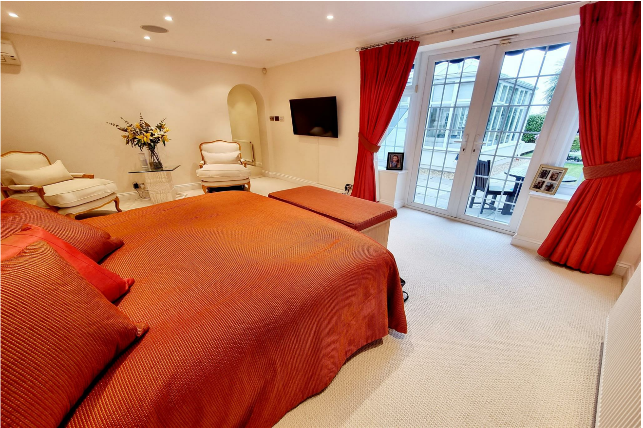
MASTER BEDROOM LOBBY AREA: 14'6 x 4'6 (4.42m x 1.37m) Leading to the Master Bedroom and the En Suite Bathroom.