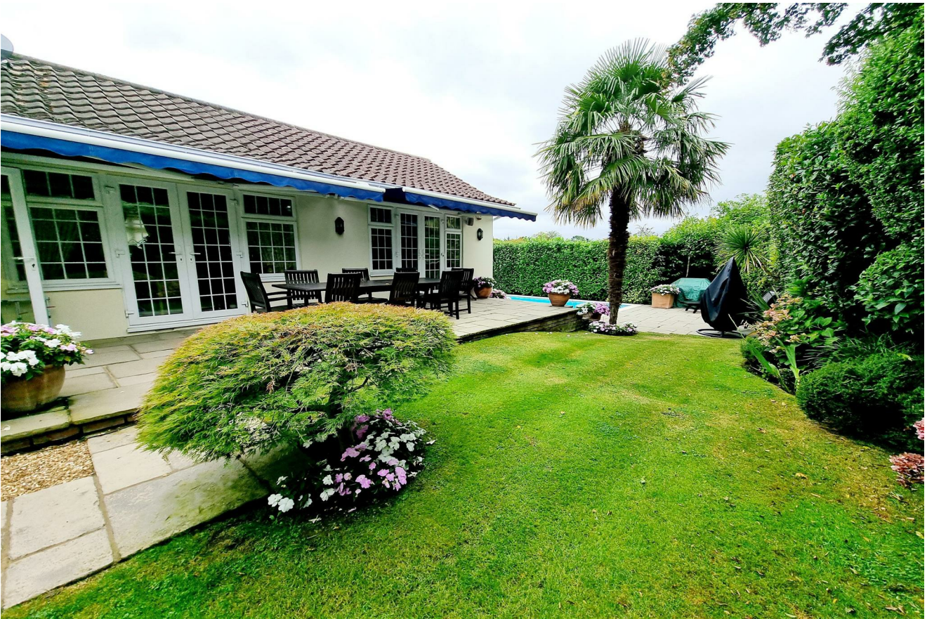
FURTHER GARDEN AREA: Steps from Paved Patio Area to Swimming Pool, but there is also a Gentle Slope on the Lawn for Easy Access. Electric Controlled Awnings.