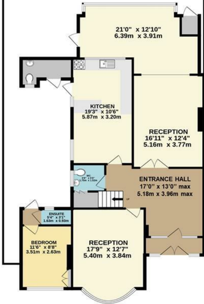
GROUND FLOOR 1263 sq.ft. (117.3 sq.m.) approx.