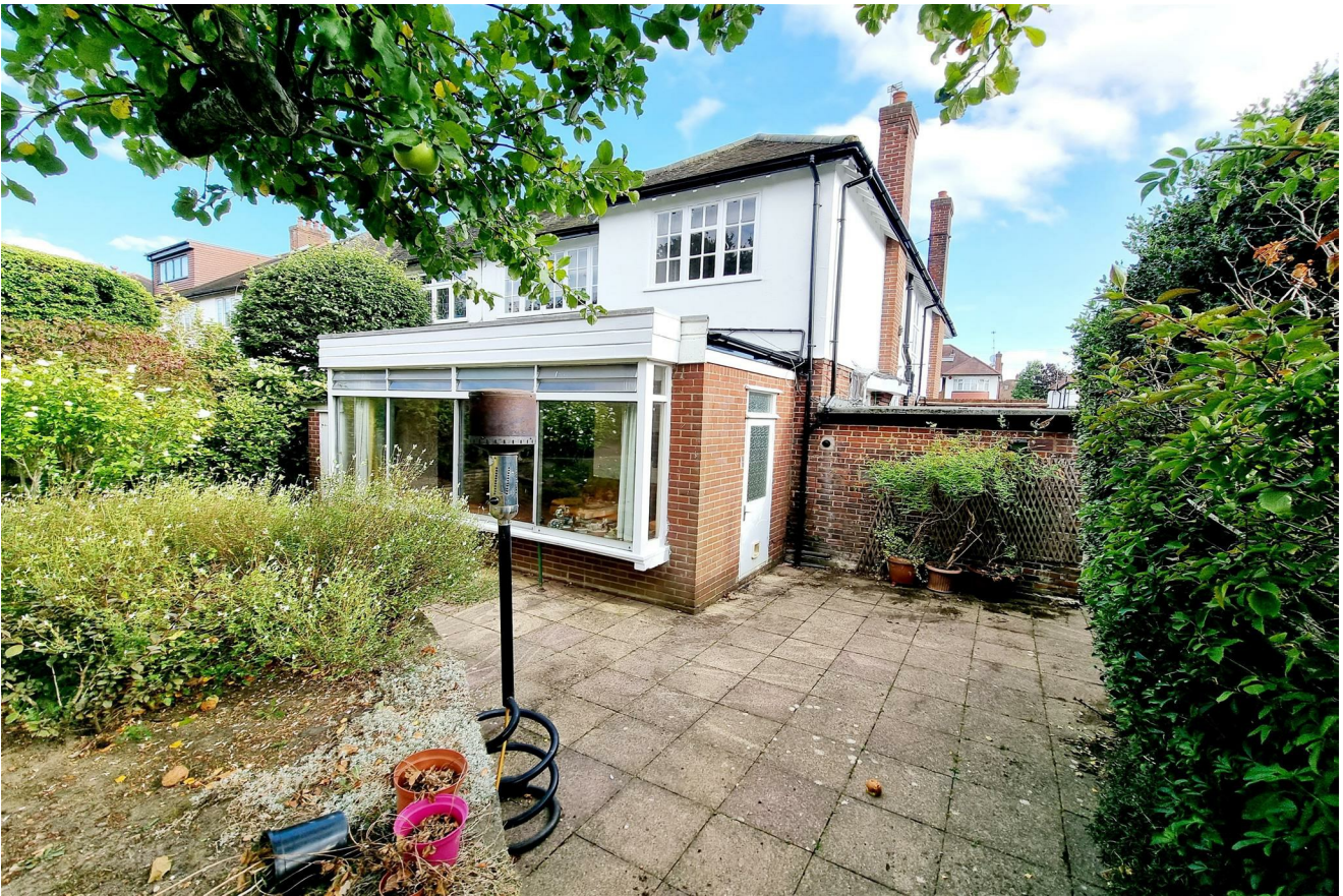
PAVED PATIO AREA TO SIDE: A Very Useful Area.