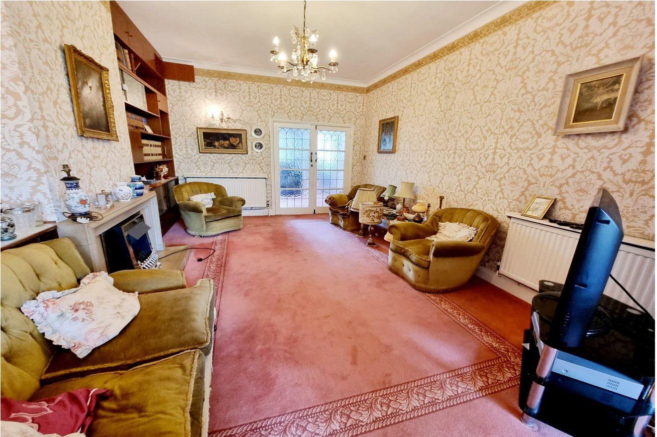
EXTENDED REAR RECEPTION ROOM: PIC. 3 Rear Extension with Wide Window Overlooking Rear Garden, Door to Side Patio.