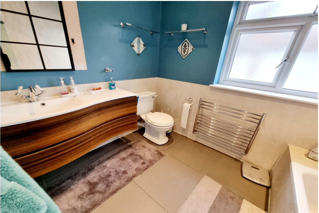
FAMILY BATHROOM 2: