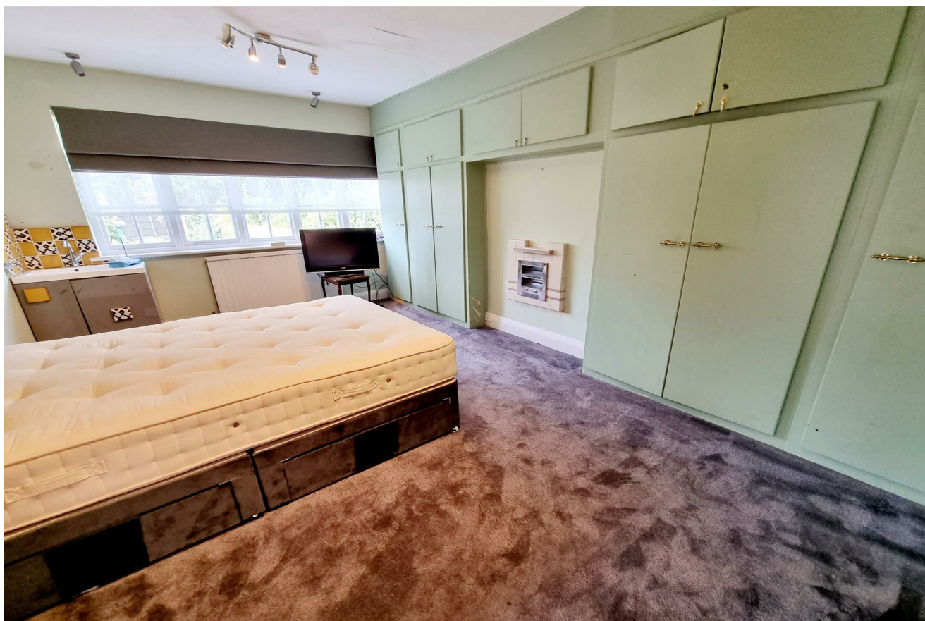
BEDROOM 3: 12'7 x 10'2 (3.84m x 3.10m) Double Glazed Window to Front, Fitted Wardrobes & Dressing Table. Radiator.