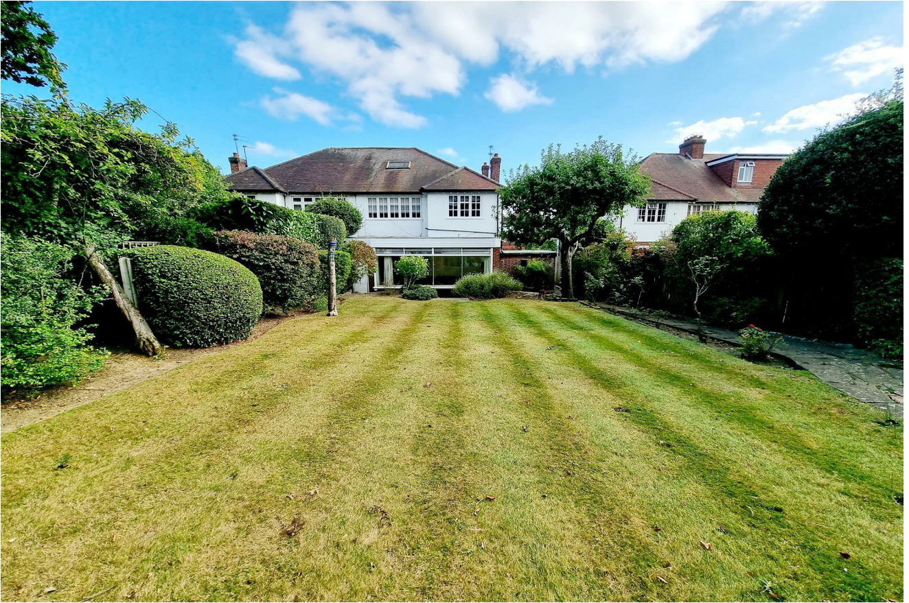
REAR ELEVATION OF PROPERTY: PIC. 1