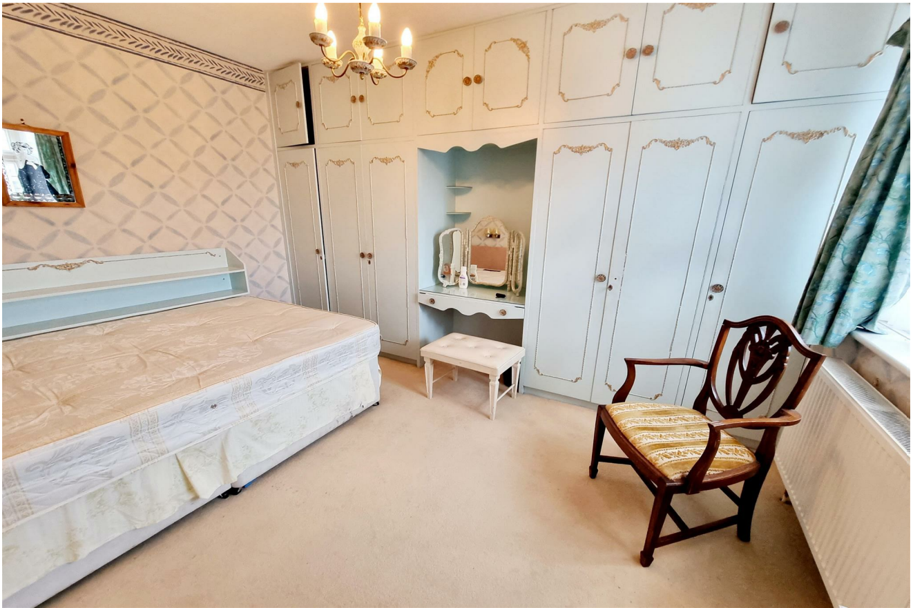
BEDROOM 4: 13'1 x 10'6 (3.99m x 3.20m) Fitted Wardrobes, Fitted Sink with Mixer Taps. Window to Rear Overlooking Rear Garden, Radiator.