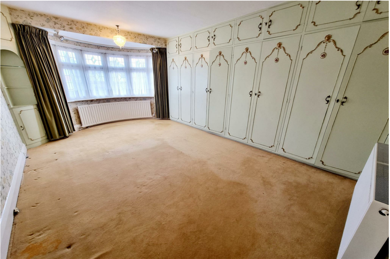
BEDROOM 2: 17' x 12'5 (5.18m x 3.78m) Window to Rear Overlooking Garden, Fitted Wardrobes, Radiator.