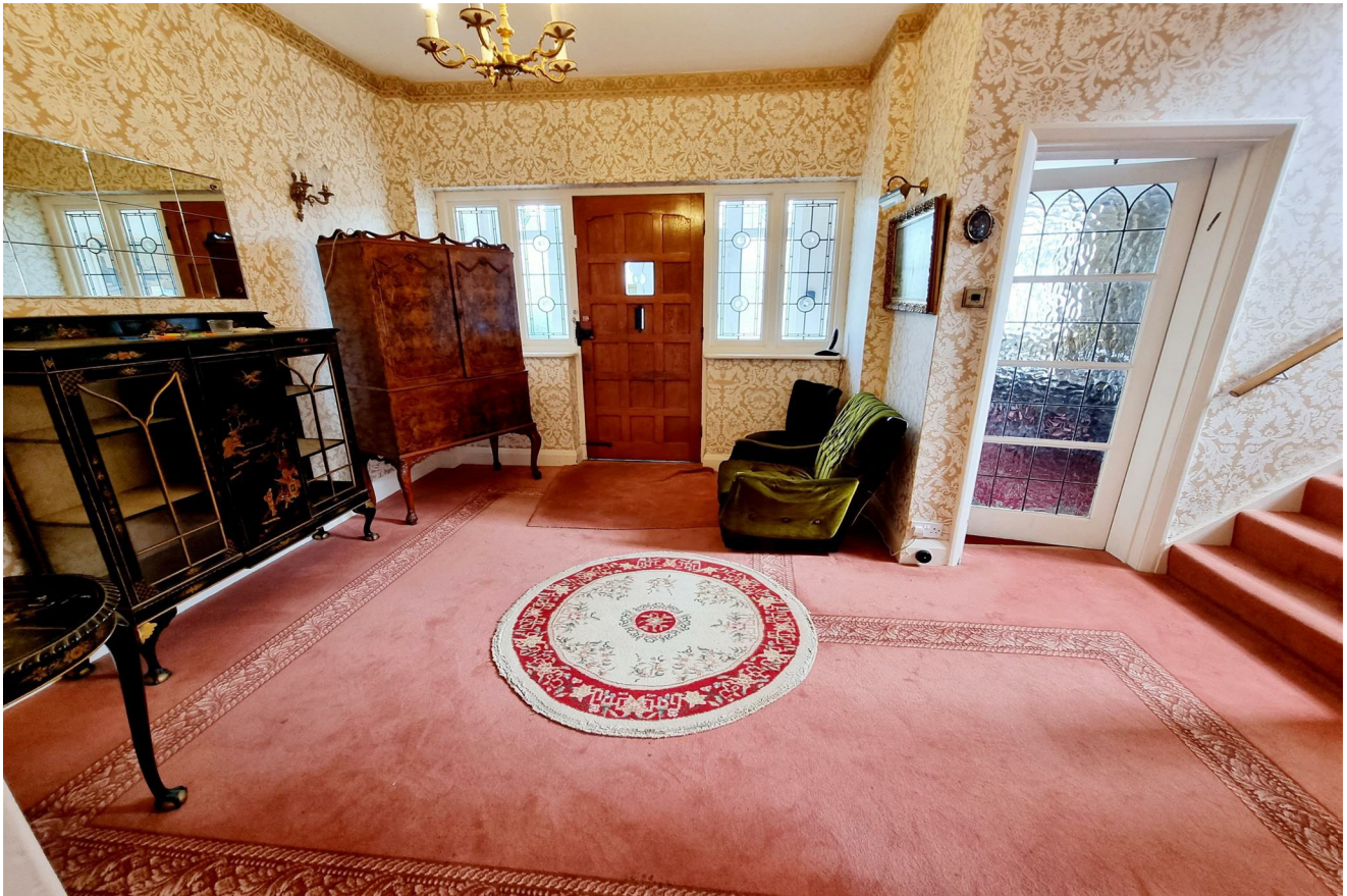
EXTENDED REAR RECEPTION ROOM: PIC. 1 29' x 21'4 narr to 12'4 (8.84m x 6.50m narr to 3.76m)

A Real Feature of This Property. Extremely Spacious and with a High Ceiling. Oak Front Door, Access to Both Reception Rooms, Morning Room, Fitted Kitchen, and Downstairs Cloakroom.