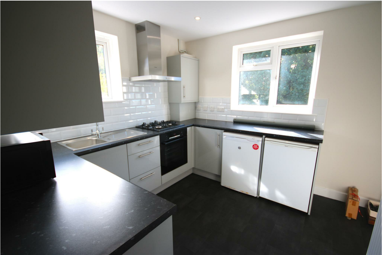
KITCHEN (Pic 2)

Dual Aspect kitchen with Newly fitted Modern Grey Gloss Wall & Base Units, Tiled Splashback, integrated Oven, Hob & Extractor Hood. Under counter Fridge, Freezer and Washing Machine.