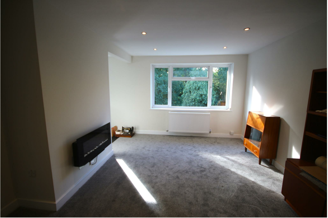
RECEPTION (Pic 2)

Large Double Glazed Window to rear, Freshly carpeted with Neutrally decorated walls, spotlights, radiator and a Feature electric fireplace. Large opening from Reception into Kitchen.