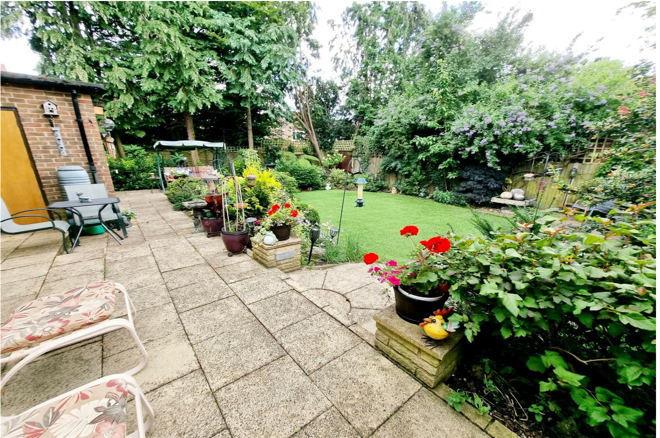
BEAUTIFUL REAR GARDEN: PIC. 3 Further Paved Patio Area and Shrubs.

Showing the Large Paved Patio Area Accessed Via the Double Glazed Patio Doors from Reception Room 2.