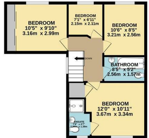
1ST FLOOR 532 sq.ft. (49.5 sq.m.) approx.