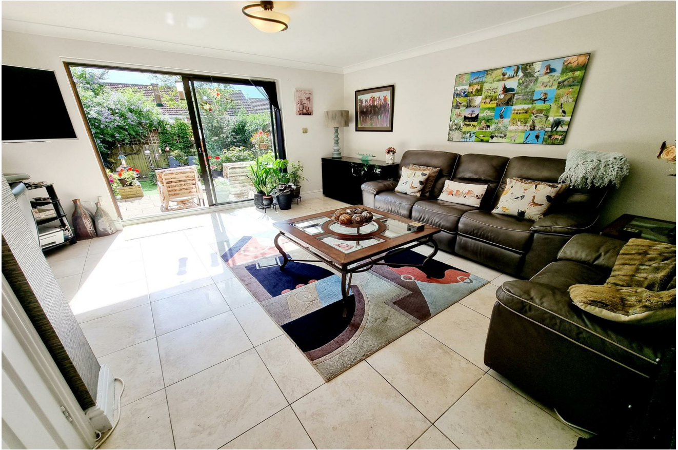
RECEPTION ROOM 2: PIC. 2 Different Aspect, Showing Door to Hallway.

This Would be the Original Reception Room Which Widens to the Rear, Ceramic Flooring, Cornicing, Double Radiator. Deep Storage Cupboard. Double Glazed Sliding Patio Doors to Rear Garden, Double Doors with Leaded Lights to Reception Room 1.