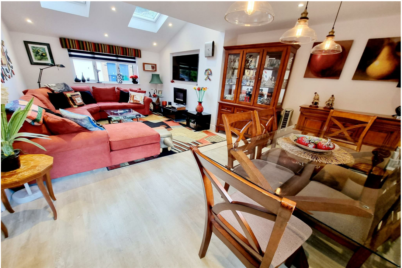
RECEPTION ROOM 1: PIC. 3 This Also Shows the Pair of Glazed Doors to the 2nd Reception Room.