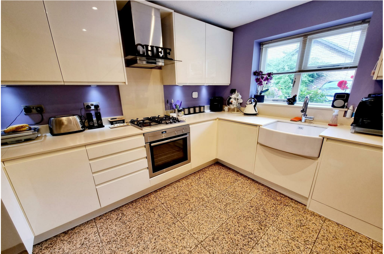
LUXURY FITTED KITCHEN/DINER: PIC. 2

Modern Floor & Wall Units, Butler Sink with Mixer Taps, Gas Hob with Neff Built Under Oven, Plumbed for American Style Fridge/Freezer, Integrated Dishwasher & Washing Machine. Double Glazed Window to Front, Marble Flooring. Space for Small Dining Table.