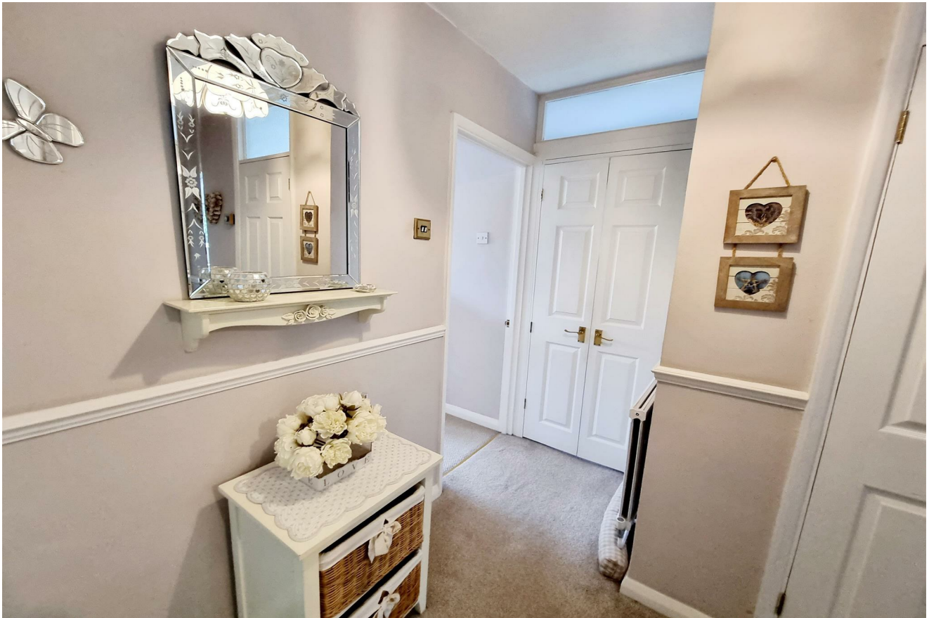
ENTRANCE HALL: PIC. 2

Own Front Door with Stairs to First Floor Landing/Entrance Hall Where there are Double Doors at the top of the Stairs.