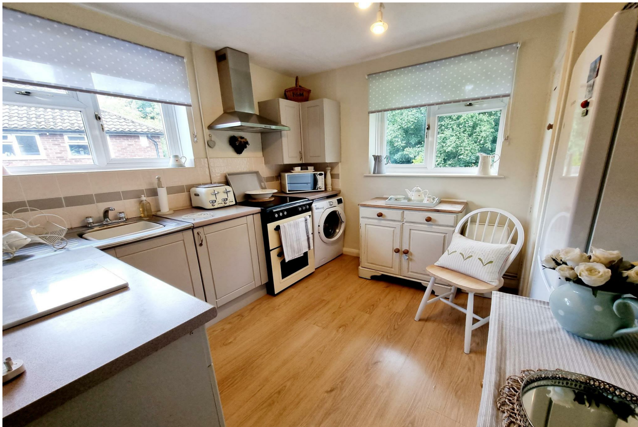
FITTED KITCHEN/DINER: PIC. 2

Floor & Wall Units, Single Drainer Stainless Steel Sink with Mixer Taps, Slot in Cooker, Recess for Fridge/Freezer. Space for Breakfast Table. Laminate Flooring. Double Glazed Windows to both Rear & Side - Both Offering a Leafy & Pleasant Outlook.