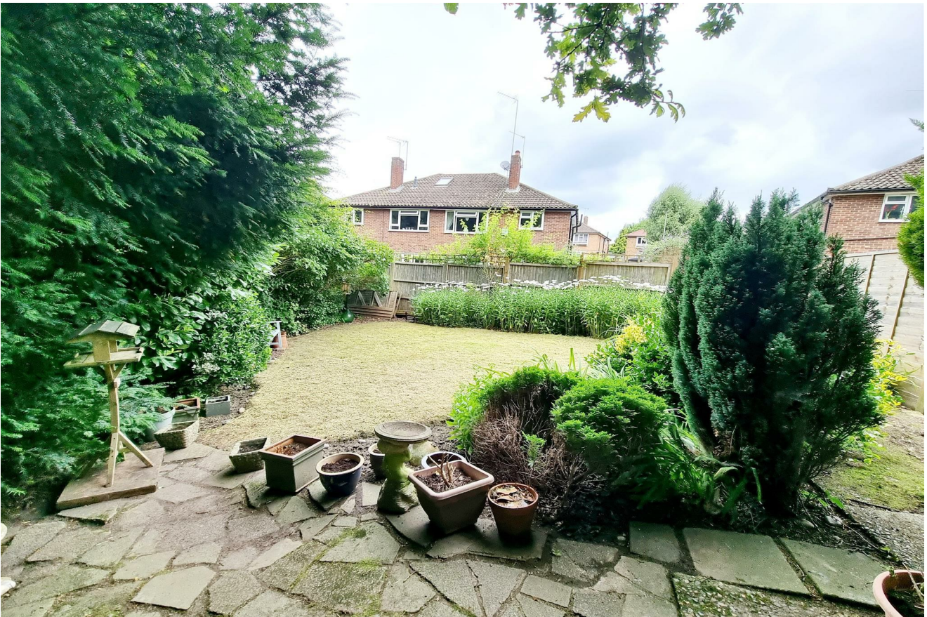
REAR SECTION WITH SHED & PATIO AREA:

A Very Useful Area at the Rear of the Garden. Note: It is Possible to Erect Fencing and a Gate to Screen the Garden Off Completely.