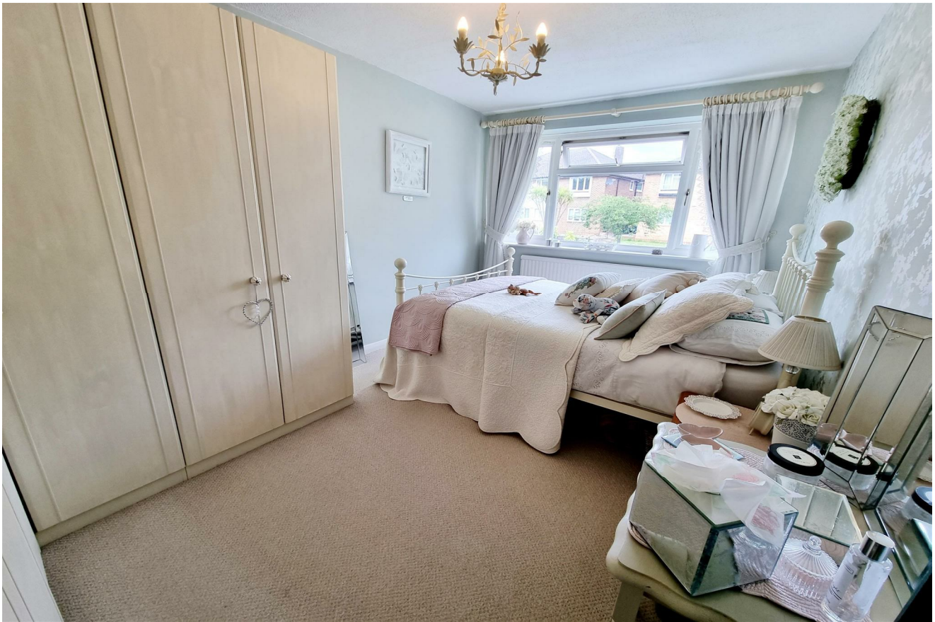
BEDROOM 2: 12'6 x 11'8 (3.81m x 3.56m) Double Glazed Window to Front, Radiator, Extra Useful Recess.