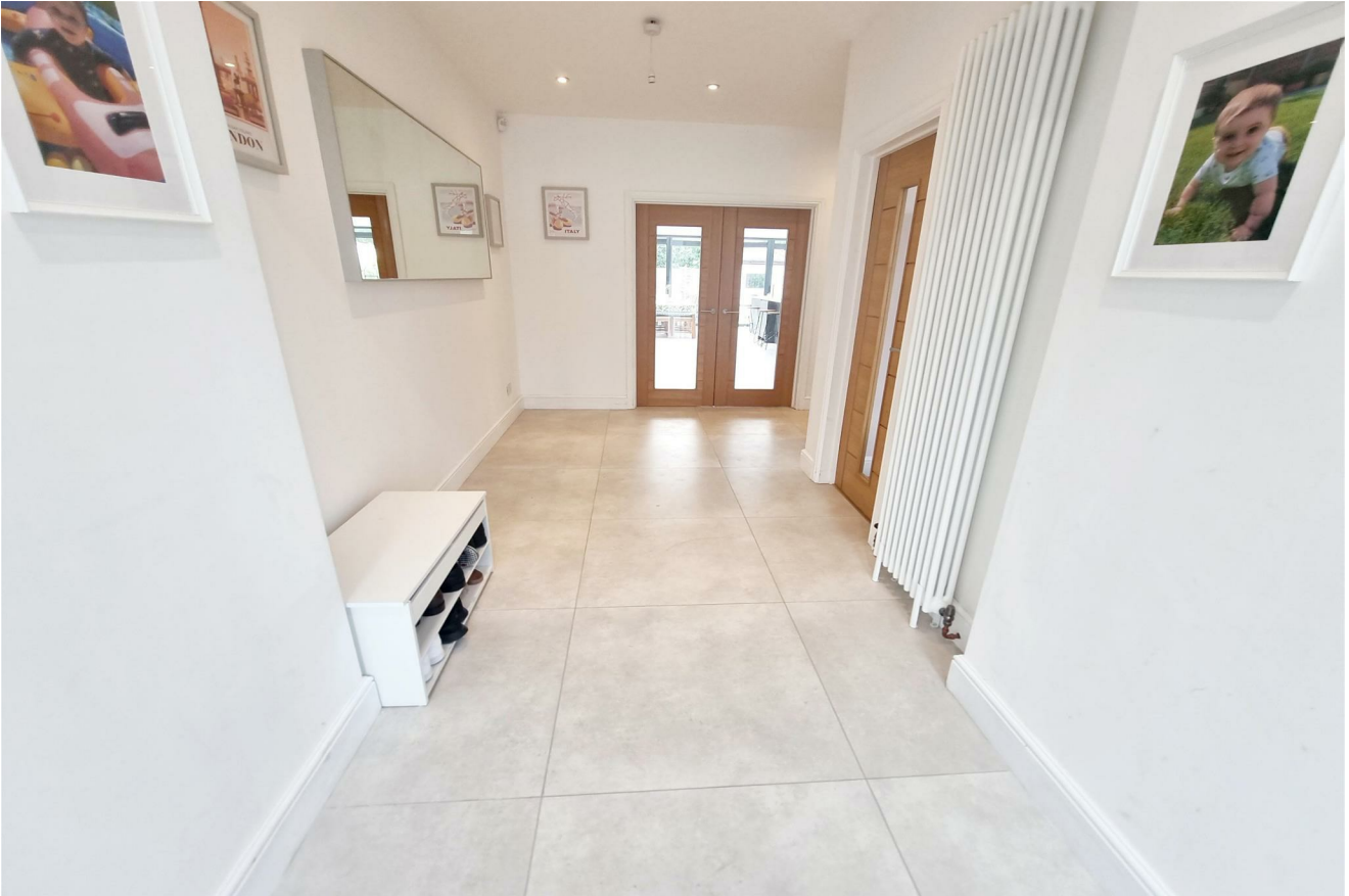
FRONT RECEPTION ROOM: 15'8 x 12'3 (4.78m x 3.73m)

Attractive Front Reception Room with 6 Panel Double Glazed Bay Window to Front, Double Glazed Windows to Side, Up to the Minute Log Effect Fire with Many Different Settings, Parquet Flooring, Radiator. Underfloor Heating.