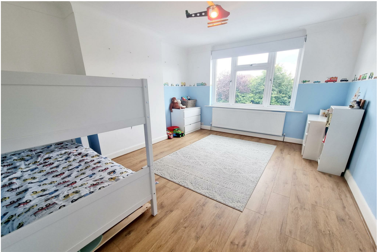
BEDROOM 2: PIC. 2