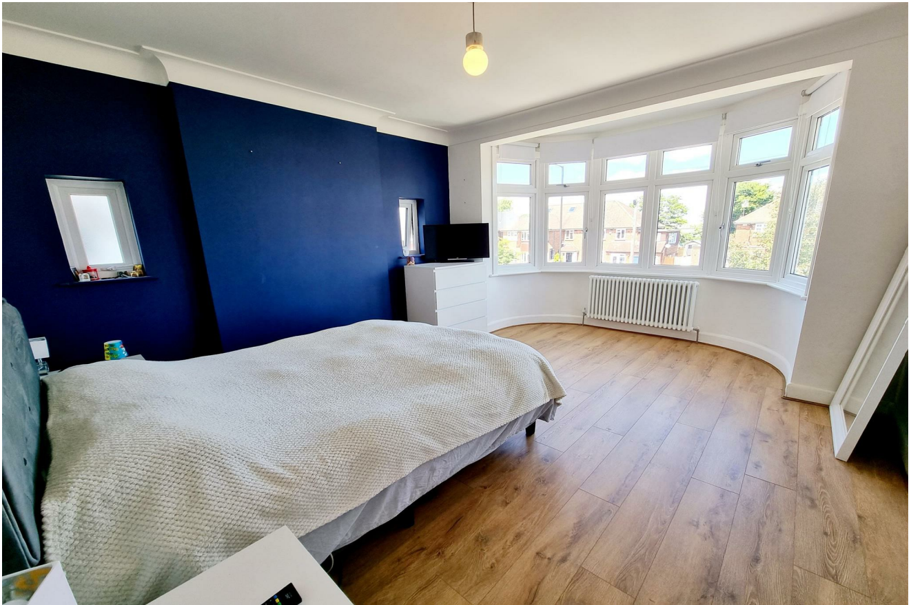
BEDROOM 1: PIC. 2 Different Aspect.

6 Panel Double Glazed Bay Window, 2 x Double Glazed Arched Side Windows, Radiator, Laminate Flooring, Cornicing.