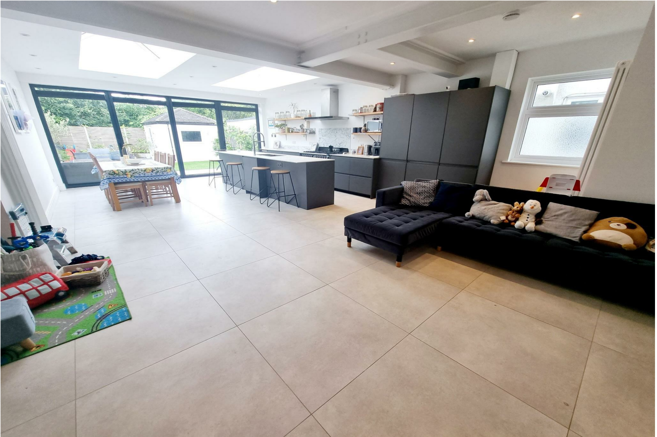
EXTENDED REAR RECEPTION ROOM: PIC. 2 Different Aspect, Showing Wood Burner. Vertical Radiators, Spotlights.

EXTENDED REAR RECEPTION ROOM: PIC. 1 31' x 20'7" narr to 17'4" (9.45m x 6.27m narr to 5.28m) Enormous Rear Reception Room with Open Plan Fitted Kitchen/Diner, Ceramic Flooring, Vertical Radiators. Chimney Breast with Cast Iron Wood Burner, Double Glazed Fully Opening Double Glazed Doors to Rear. Double Glazed Window to Side. Ceramic Flooring, Underfloor Heating.