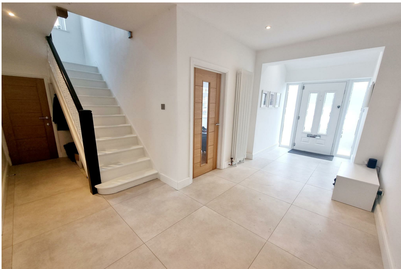
ENTRANCE HALL: PIC. 2 Ceramic Tiled Flooring with Underfloor Heating.

ENTRANCE HALL: PIC. 1 18'6 x 7'1 widening to 16'10 (5.64m x 2.16m widening to 5.13m) Bright, Spacious and Extended Entrance Hall with Part Glazed Security Door and Side Panels, Ceramic Flooring. Part Glazed Door to Front Reception Room, Double Part Glazed French Doors to Extended Rear Reception Room and Luxury Fitted Kitchen/Diner, Door to DOWNSTAIRS CLOAKROOM/SHOWER ROOM. Vertical Radiator, Spotlights. Turning Staircase to First Floor.