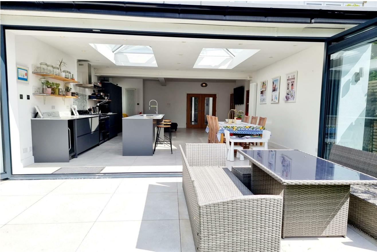
REAR ELEVATION & PATIO AREA: