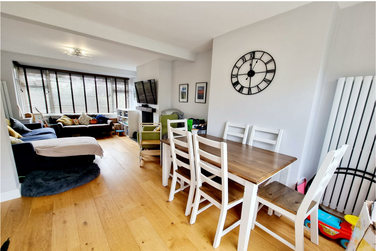
LOUNGE AREA: Spacious Reception Room to Front.