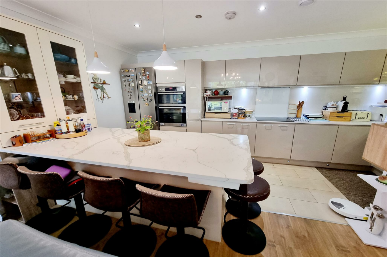
LUXURY KITCHEN/DINER: PIC. 2 Different Aspect of Luxury Fitted Kitchen/Diner.

Well Fitted with Ample Floor & Wall Units, Inset Sink with Mixer Taps, AEG Induction Hob with Extractor Over, AEG Double Built in Oven with Microwave Above. Recently Fitted Quartz Breakfast Bar with Extra Display Cabinet, Built Under Cupboards & Fridge. Space for American Fridge/Freezer.