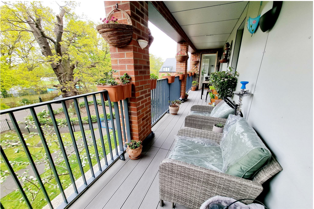
LONG BALCONY: PIC. 2