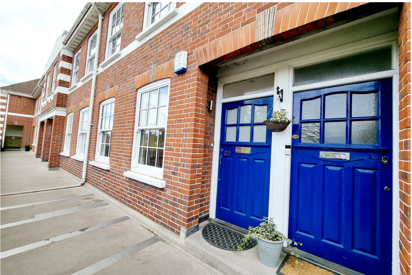
OUTLOOK TO FRONT: