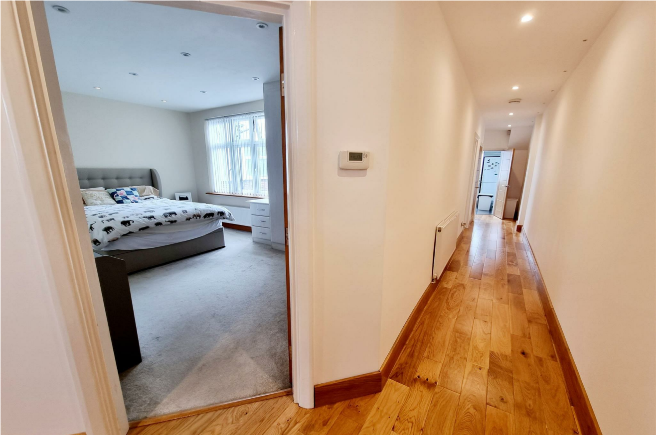
ENTRANCE TO FLAT: