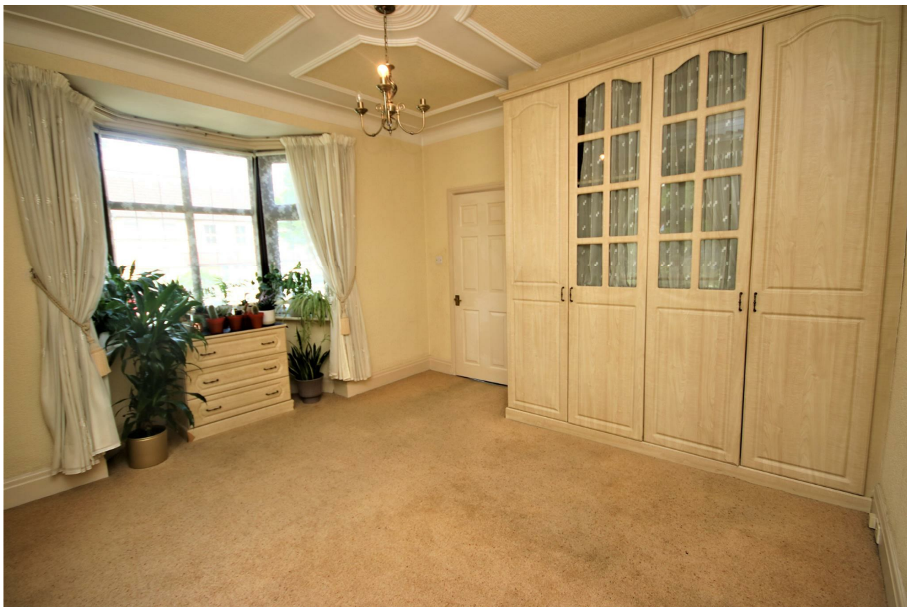
BEDROOM 1: PIC. 2 Different Aspect Showing Fitted Wardrobe Span.