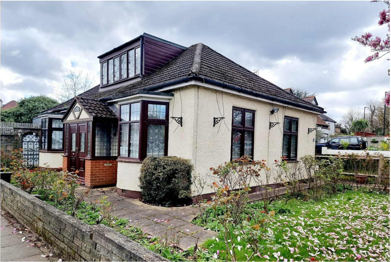
FRONT GARDEN: PIC. 1 Mainly Laid to Lawn with a Very Mature Magnolia Tree.