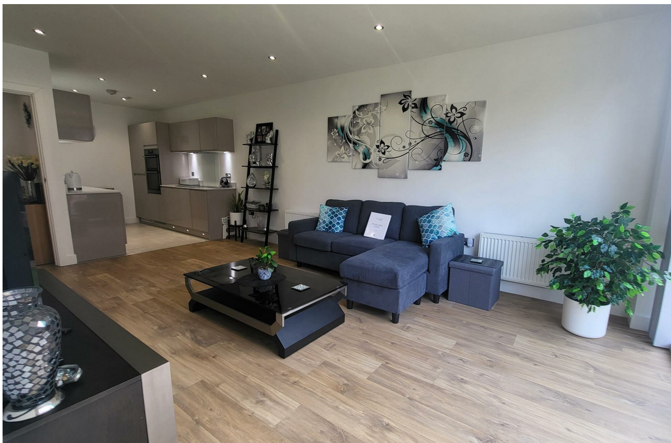
LIVING/DINING ROOM (pic 3) Futher Aspect Also Showing the Luxury Fitted Kitchen and Door to Hallway.