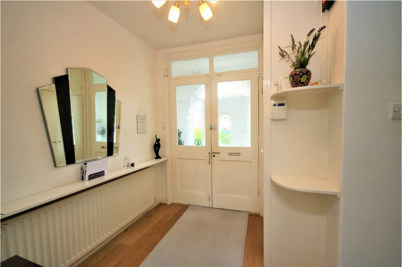
EXTENDED REAR RECEPTION ROOM: PIC. 1 19'9" x 11'3" (6.02 x 3.43) Extended Room with Double Glazed Sliding Patio Doors to Rear, Approached via Pair of Glazed Doors from Hallway. Radiator.