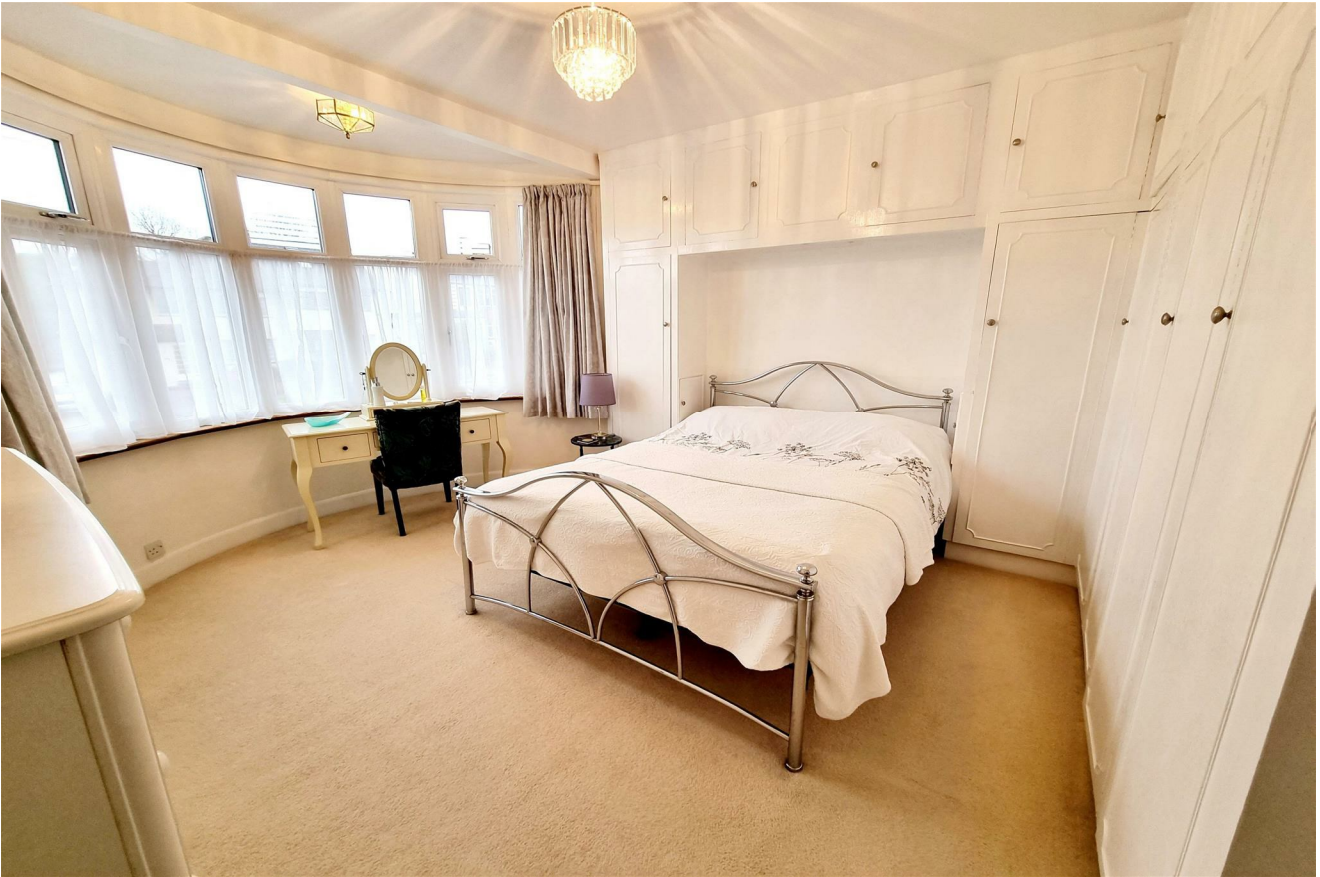
BEDROOM 2: 13'3" x 12'6" (4.04 x 3.81) Double Glazed Bay Window to Rear, Fitted Wardrobes, Radiator.