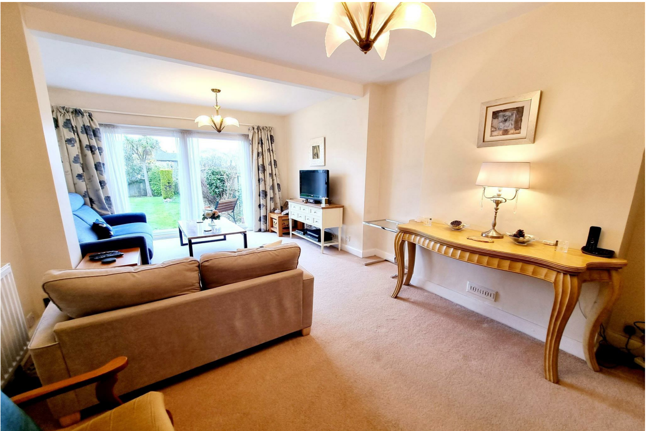
FRONT RECEPTION ROOM: 15'0" x 12'9" (4.57 x 3.89) Double Glazed Bay Window, Radiator, Door to: