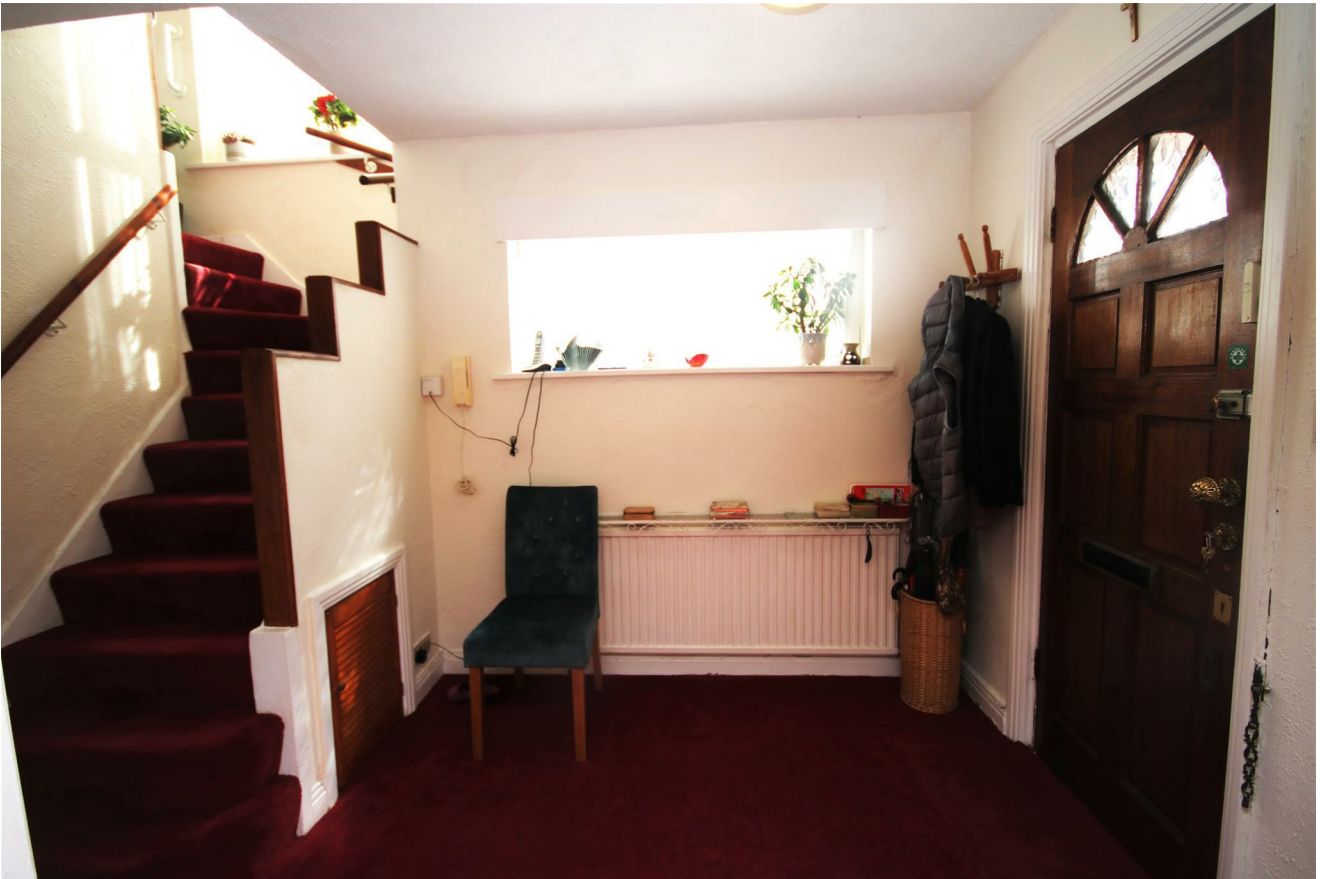
THROUGH LOUNGE: PIC. 1 26'6 x 11' (8.08m x 3.35m)

Spacious with Georgian Fanlight Wooden Door, Window to Side, Radiator. Access to Through Lounge/Both Rooms and Kitchen/Diner, plus Turning Staircase to First Floor.