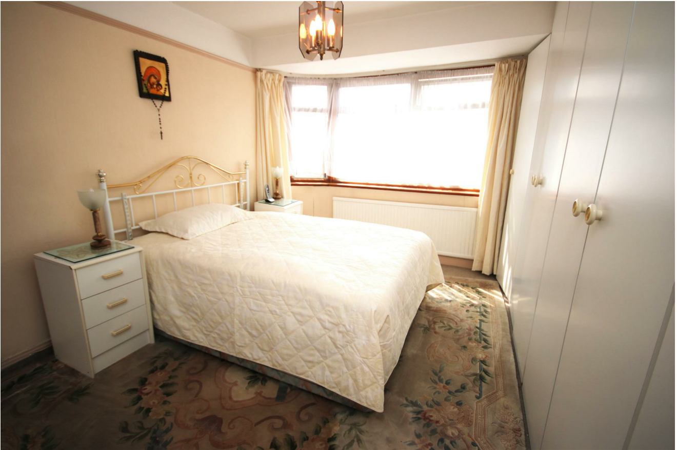
BEDROOM 2: 13'7 x 11' (4.14m x 3.35m) Double Glazed Window to Rear, Fitted Wardrobes, Radiator.