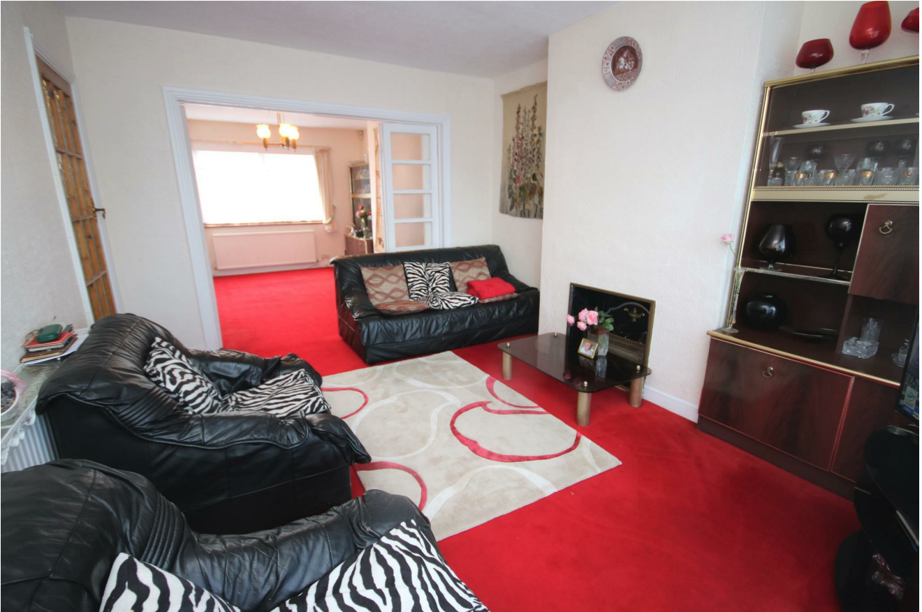
REAR RECEPTION ROOM: 13'3 x 11' (4.04m x 3.35m) Double Glazed Sliding Patio Doors to Patio & Rear Garden, Radiator, Archway to: