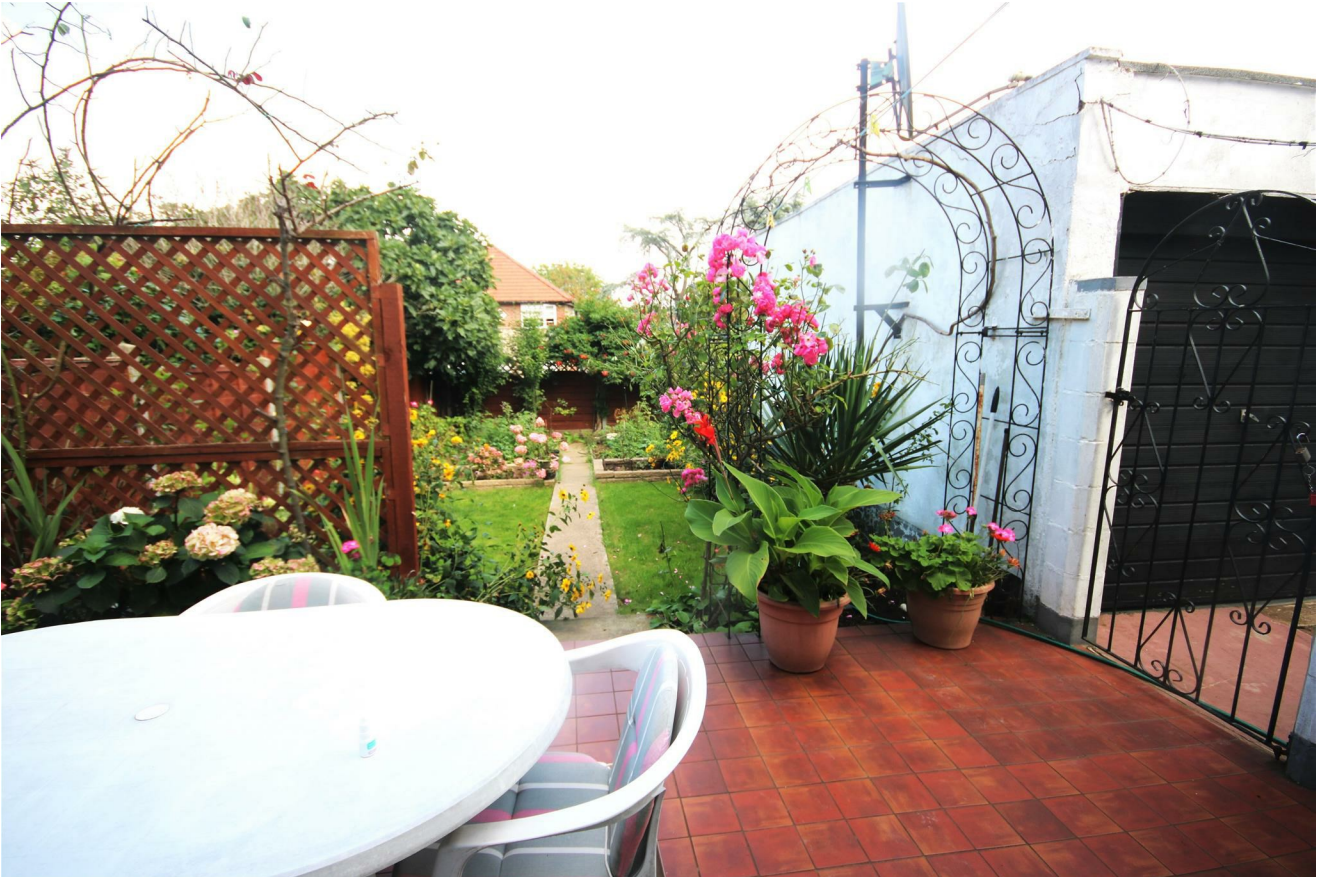
VEGETABLE PLOT AREA TO THE REAR: