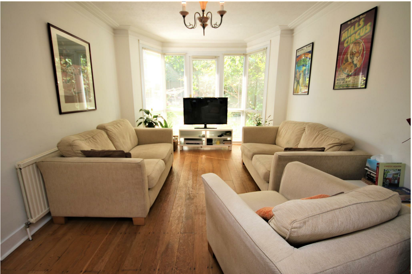
DINING AREA: 12'7 x 11'2 (3.84m x 3.40m) Double Glazed Bay Window, Wood Strip Flooring, Double Radiator, Cornicing.