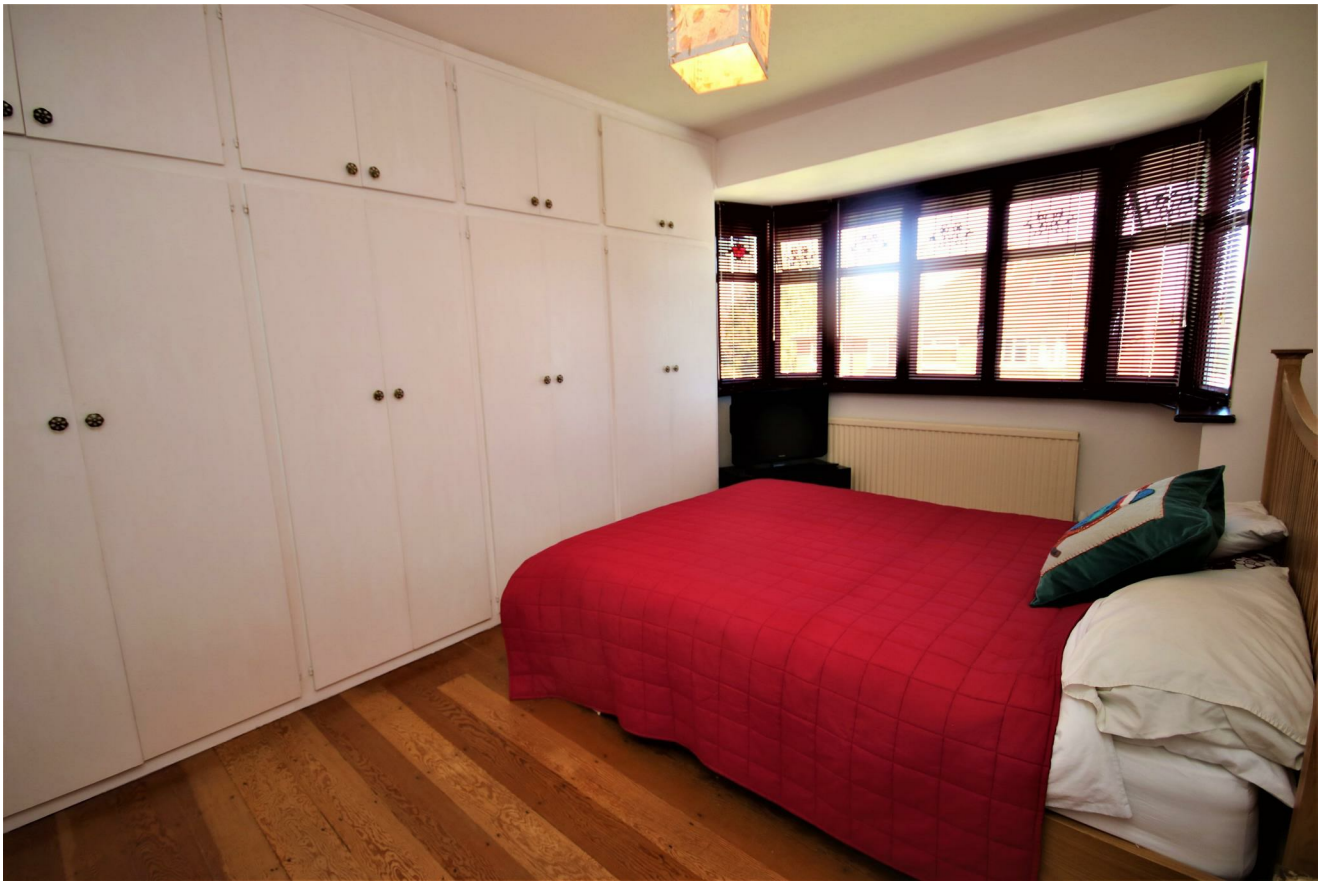
BEDROOM 2: 13'2 x 11'2 (4.01m x 3.40m) Double Glazed Bay Window to Rear Overlooking Garden, Fitted Wardrobes, Wood Strip Flooring, Radiator.