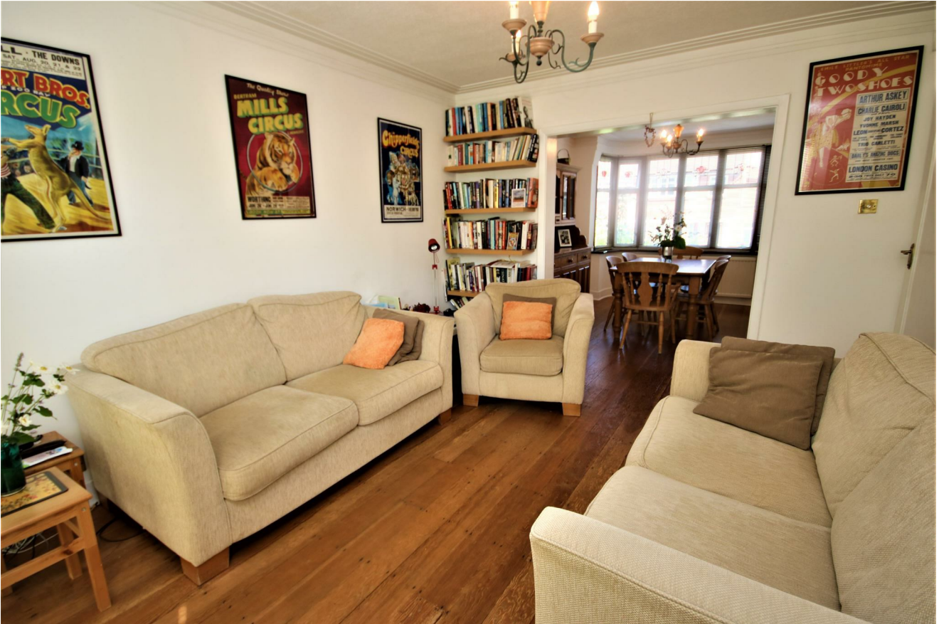
THROUGH LOUNGE: PIC. 2 Different Aspect from Front to Rear.