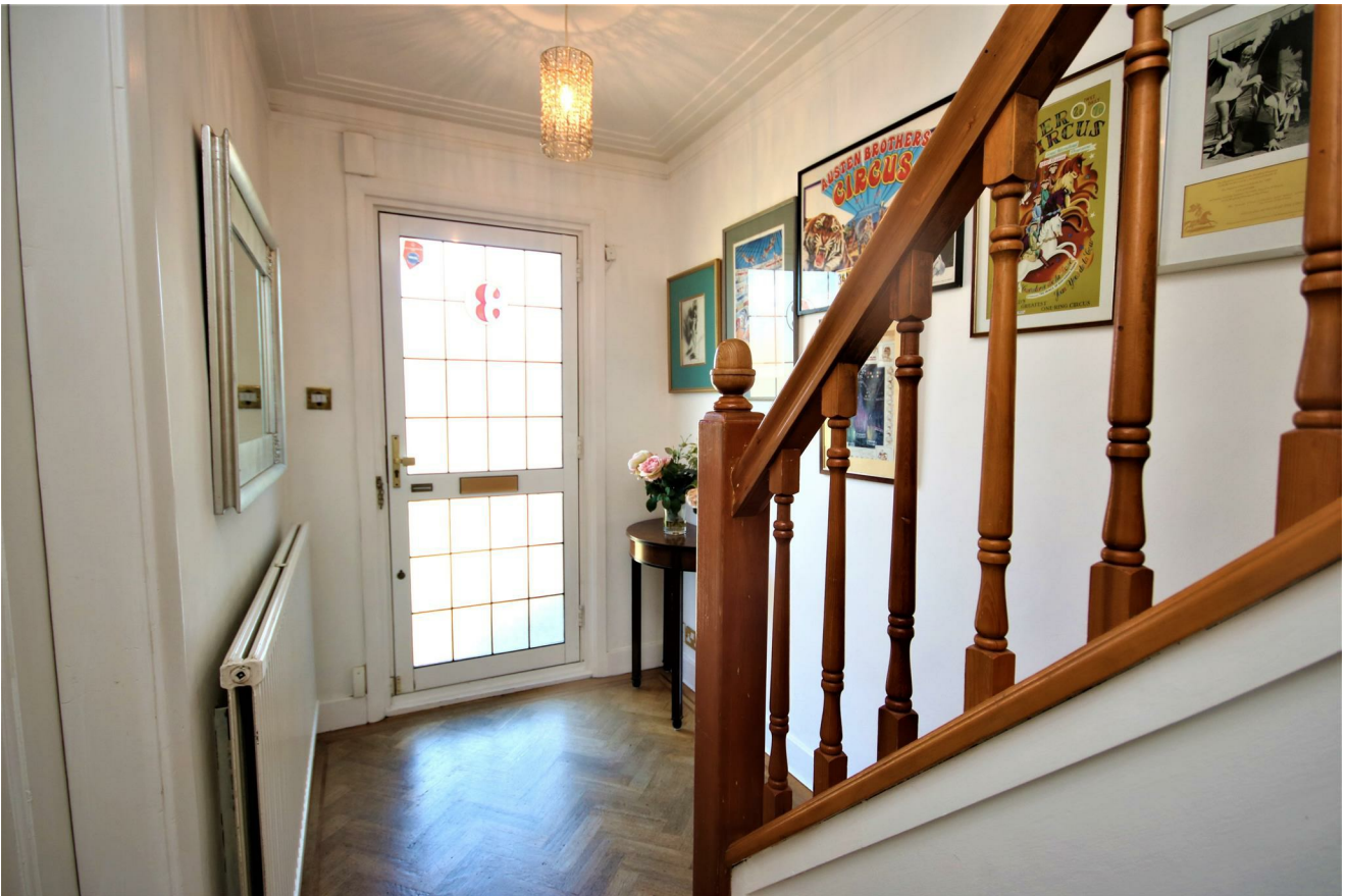
ENTRANCE HALL: PIC. 2 Different Aspect. Also Access to All Rooms & DOWNSTAIRS CLOAKROOM.