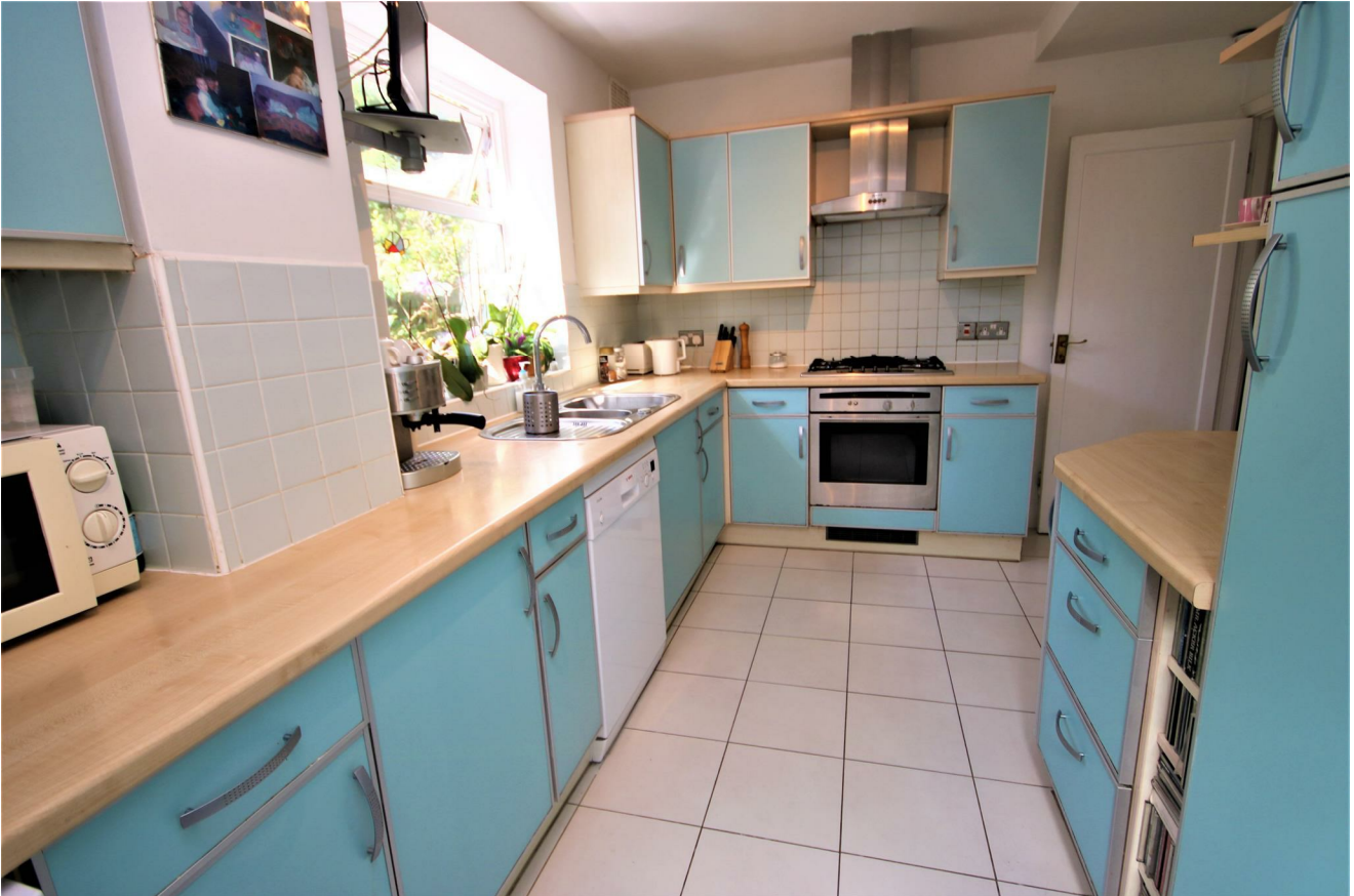
FITTED KITCHEN: PIC. 2 Different Aspect.

Ample Floor & Wall Units, Worktops, 1.5 Bowl Inset Stainless Steel Inset Sink with Mixer Taps, Neff 5 Ring Gas Hob with Wok Burner, Built Under Oven and Extractor Over. Plumbed for Both Dishwasher & Washing Machine. Larder Cupboard. Double Glazed Window to Rear and Double Glazed Door to Side.