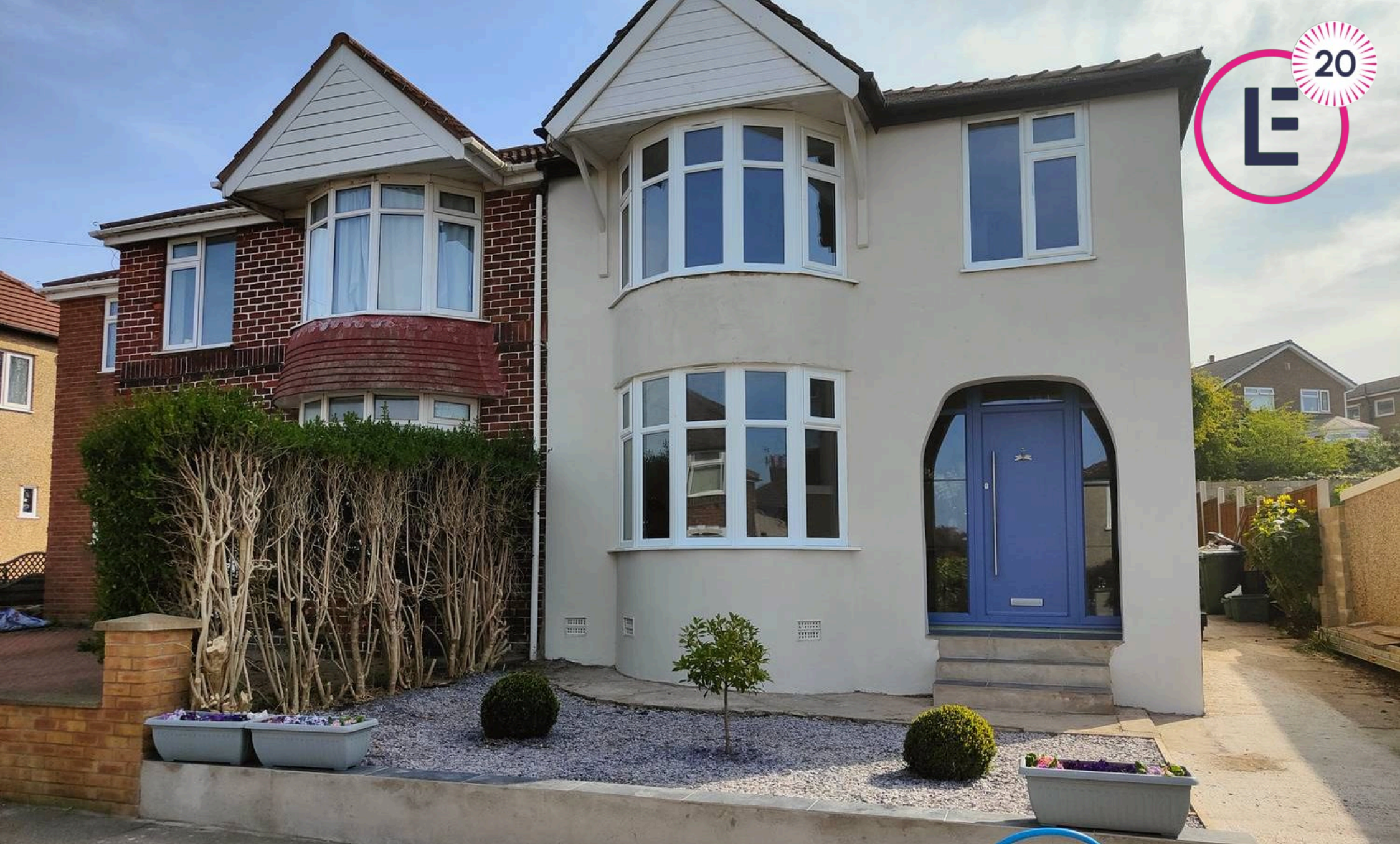
17 Kayswell Road, Morecambe Morecambe