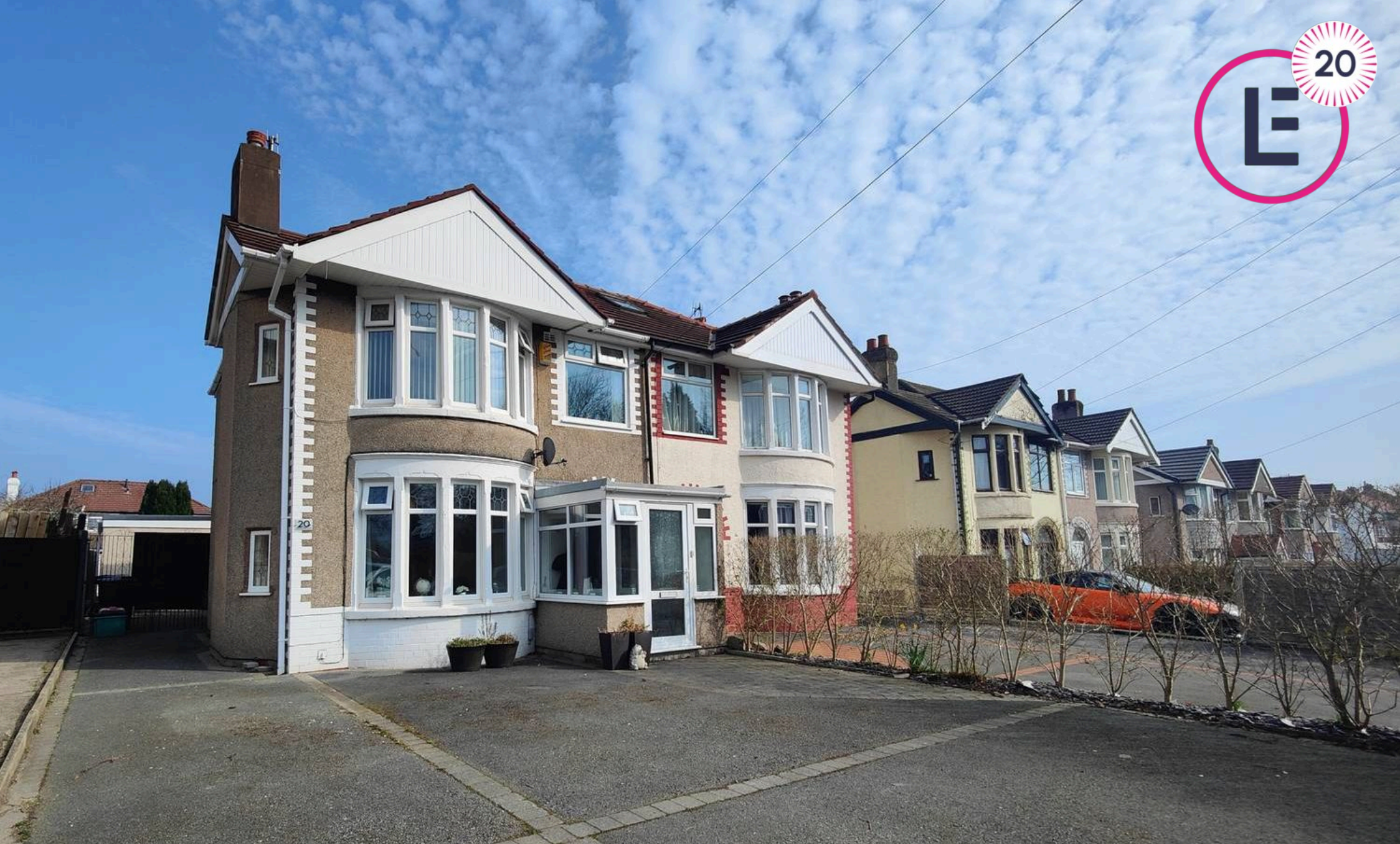
20 Morecambe Road, Lancaster Lancaster