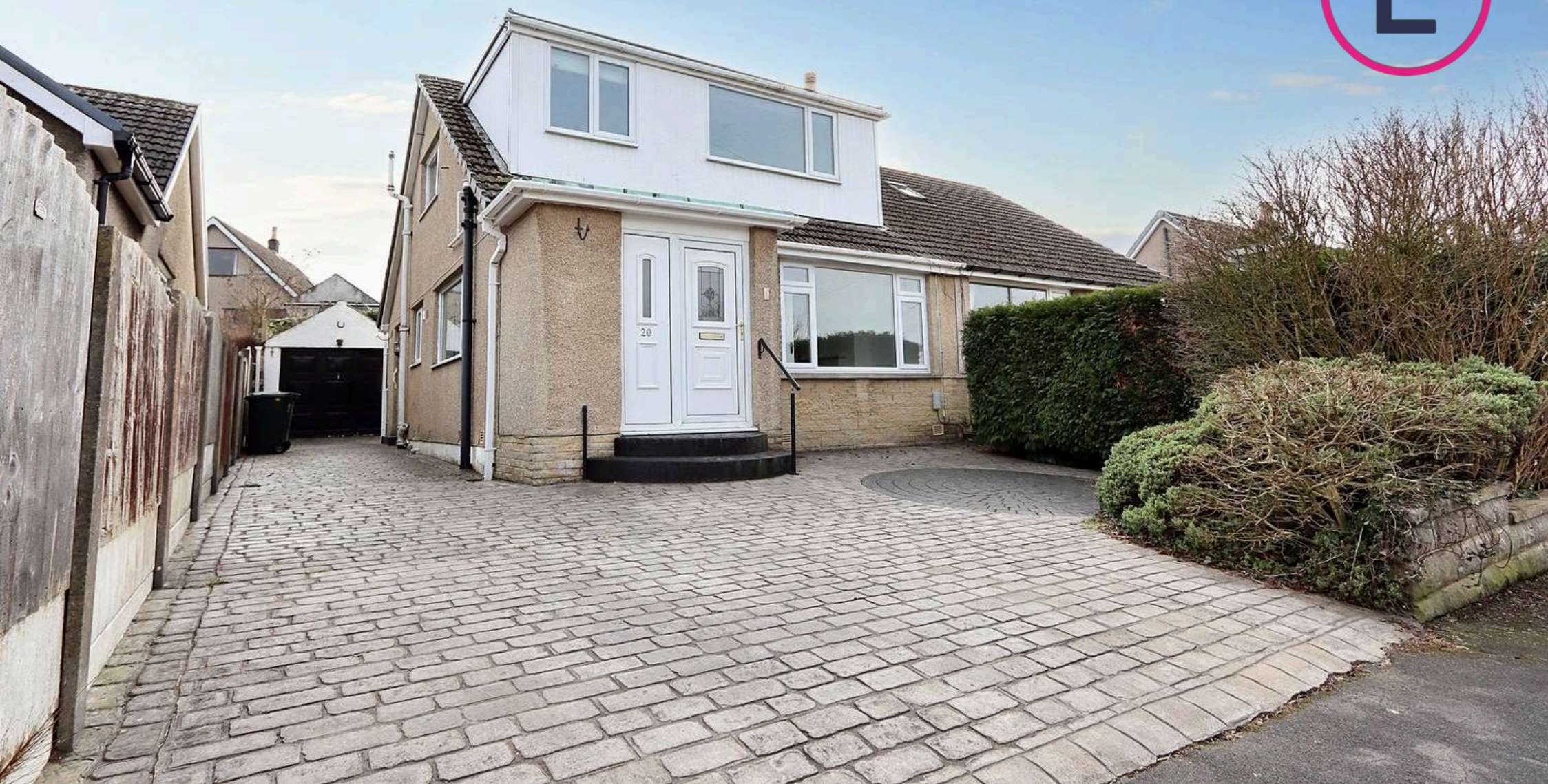
20 Hawthorn Avenue, Brookhouse Lancaster