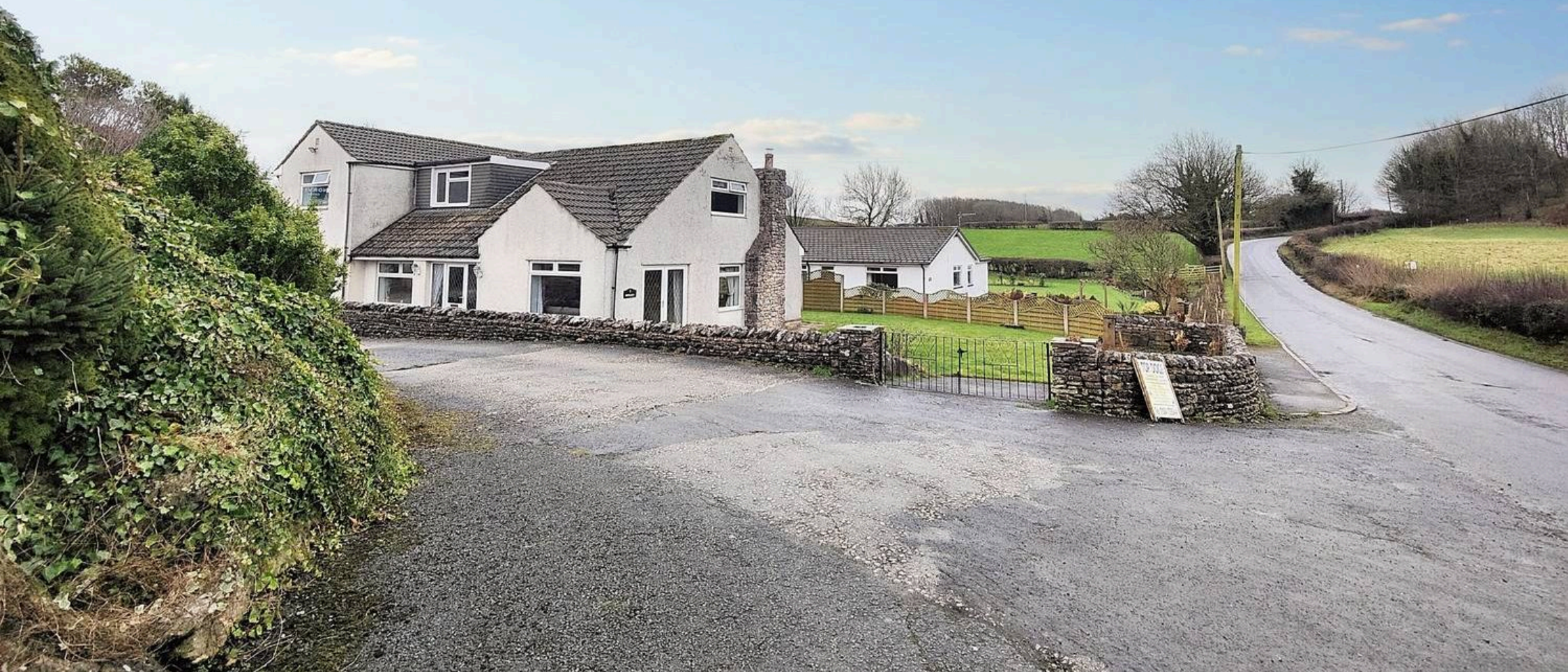
1 Newlands Farm, Nether Kellet Carnforth