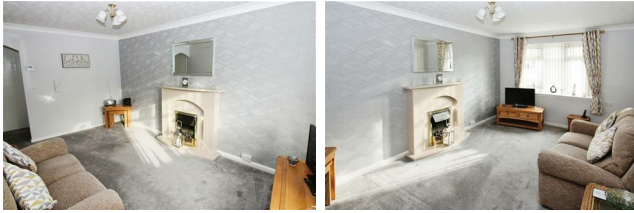
Lounge 16'2" x 10'5" (4.95 x 3.20)

Bow window to the front aspect, Feature fire place with built in electric fire and a radiator.