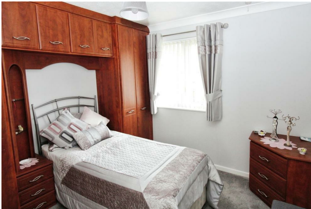
Bedroom One 9'10" x 9'8" (3.00 x 2.95)

Window to the rear aspect. Fitted wardrobes, display arches and under cupboards, dressing table unit with drawers and there is a radiator.