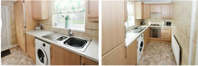
Kitchen 10'7" x 5'10" (3.25 x 1.80 )

A good range of fitted floor and wall units with rolled edge laminated preparation surfaces having an inset stainless steel sink unit with mixer tap. Window to the side aspect, plumbing for an automatic washing machine, a radiator, tiled walls and integrated appliances include an electric oven, four ring gas hob, an over head extractor fan and a fridge/ freezer