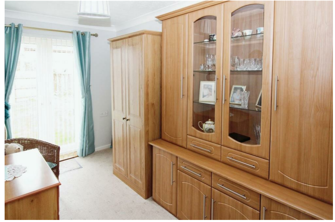
Bedroom Two 9'10" x 9'8" (3.00 x 2.95)

French Windows to the rear aspect giving access to the rear garden. Fitted wardrobes with display cabinet, over head cupboards, radiator.