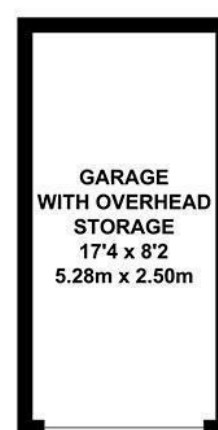
APPROX. FLOOR AREA 142 SQ.FT. (13.20 SQ.M.)

TOTAL APPROX. FLOOR AREA 1173 SQ.FT. (108.98 SQ.M.)