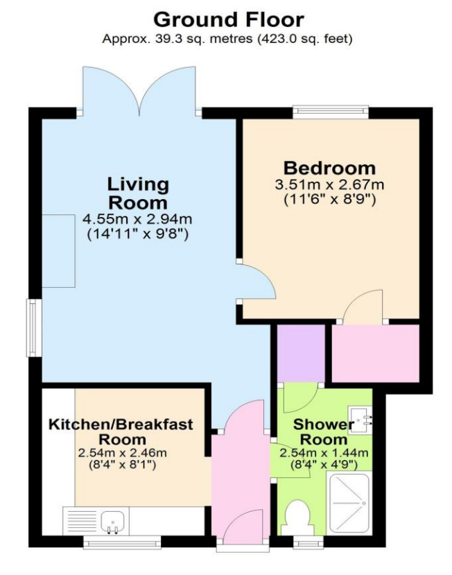
Total area: approx. 39.3 sq. metres (423.0 sq. feet)