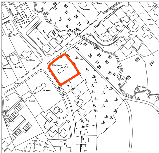
LOCATION PLAN NTS

ALL DIMENSIONS INDICATED TO BE CHECKED ON SITE FOR PLANNING PURPOSES ONLY