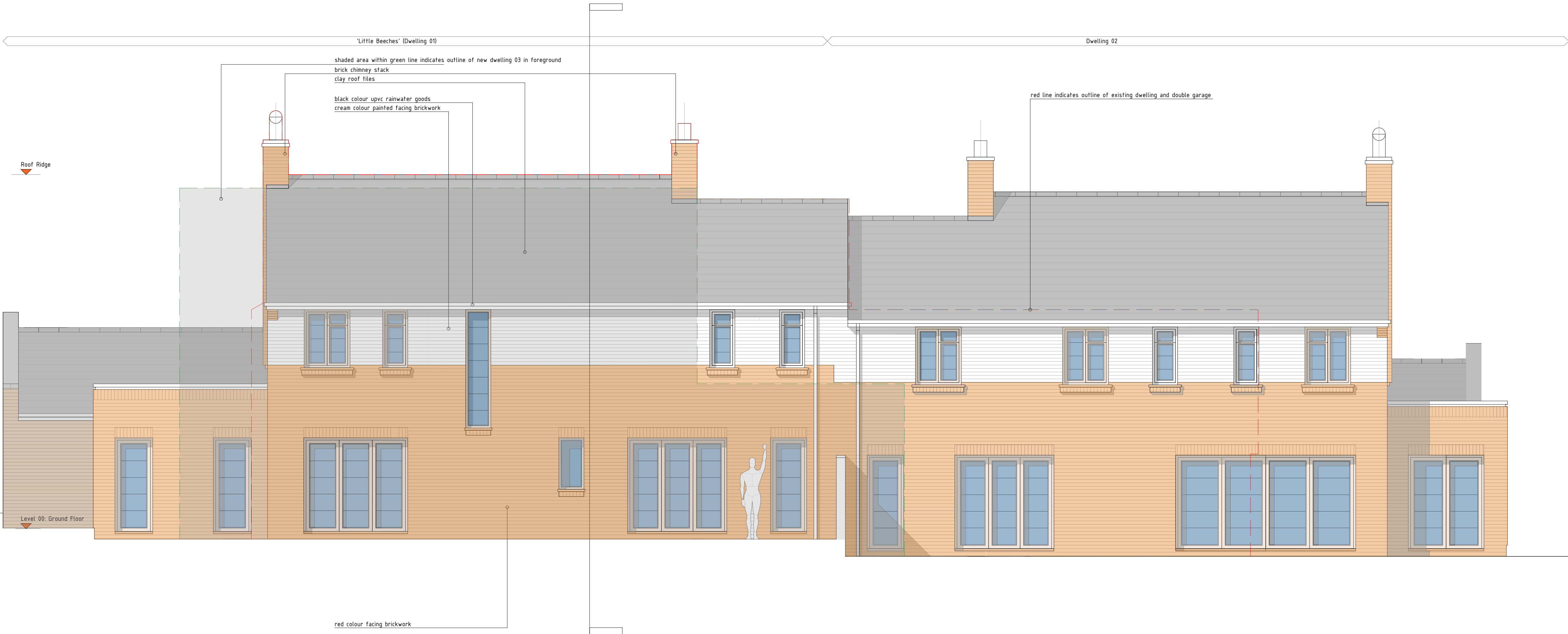
PROPOSED REAR / SOUTHEAST ELEVATION (Scale 1:50 @ A1)

ALL DIMENSIONS INDICATED TO BE CHECKED ON SITE FOR PLANNING PURPOSES ONLY