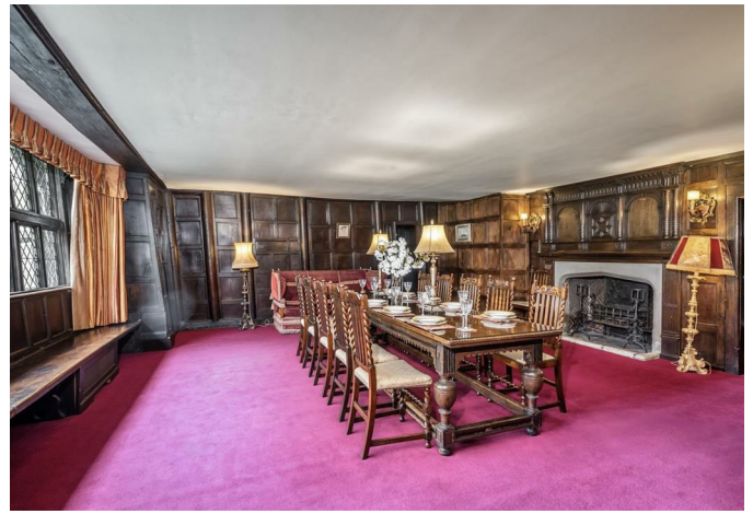
Great Tangley Manor, Guildford Upper Tangley Manor internal area 4,993 sq ft (464 sq m)