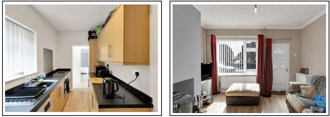
134 Gladstone Street, Winsford, Cheshire, CW7 4AZ £150,000

For Sale with NO CHAIN...... This traditional two bedroom semi detached property is situated in a popular residential area and is within walking distance of the local schools, shops and other amenities close to hand as well as easy access to commuter routes. With accommodation that includes a lounge, dining room, kitchen and bathroom on the ground floor whilst to the first are two double bedrooms with an additional room off the primary bedroom which would lend its self to a study/nursery or potential conversation to ensuite. Externally the property has low maintenance gardens to both the front and rear. Viewing advised to fully appreciate the property.