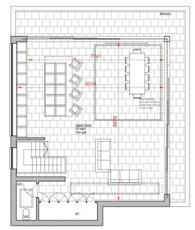
Third Floor Plan