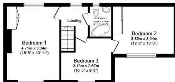
First Floor Floor area 43.2 sq.m. (465 sq.ft.)

Total floor area: 134.0 sq.m. (1,442 sq.ft.)