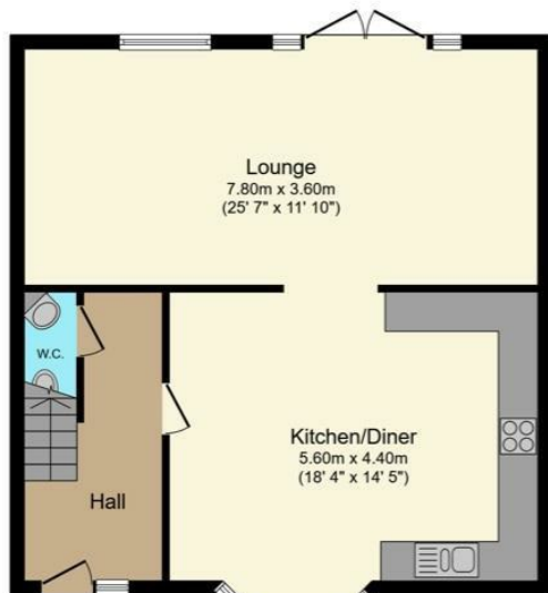
Ground Floor Floor area 64.1 sq.m. (690 sq.ft.) approx