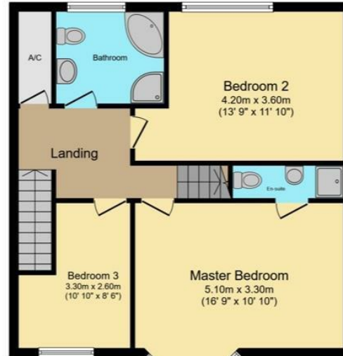
First Floor Floor area 64.1 sq.m. (690 sq.ft.) approx