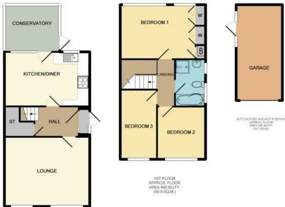
GROUND FLOOR APPROX. FLOOR AREA 524 SQ.FT. (48.7 SQ.M.)