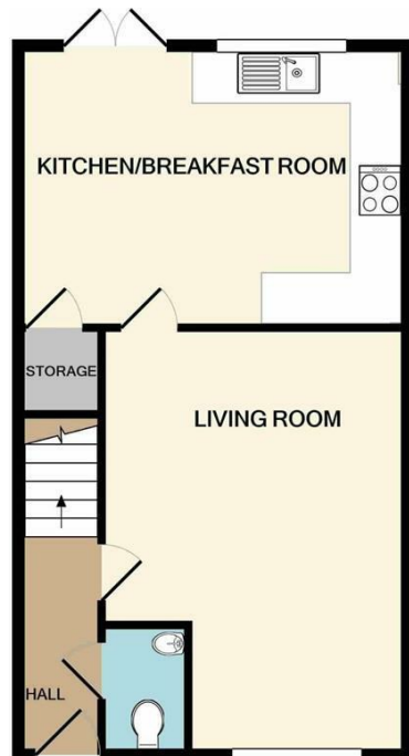
GROUND FLOOR APPROX. FLOOR AREA 412 SQ.FT. (38.2 SQ.M.)