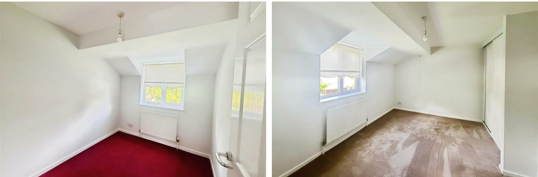
Top Floor Flat, St Georges Court, Maghull

*Measurements of doors, windows, rooms and any other items are approximate and no responsibility is taken for any error, emission, or mis-statement. This plan is for illustrative purposes only and should be used as such by any prospective purchaser. The services, systems and appliances shown have not been tested and no guarantee as to their operability or efficiency can be given. Plan produced using PlanUp.