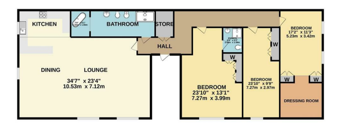
White every attempt has been made to ensure the accuracy of the floorpies contained here, measurements of doors, windows, rooms and any other items are approximate and not recognishing its altern for any error, omission or mis-statement. This plan is for illustrative purposes only and should be used as such by any prospective purchases. The services, systems and appliances shown have not been rested and no guarantee.