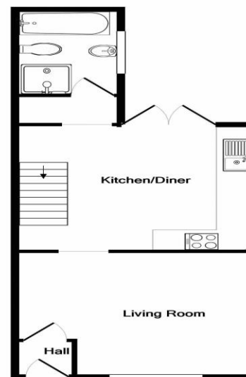
Ground Floor Approx. Floor Area 417 Sq.Ft. (38.7 Sq.M.)