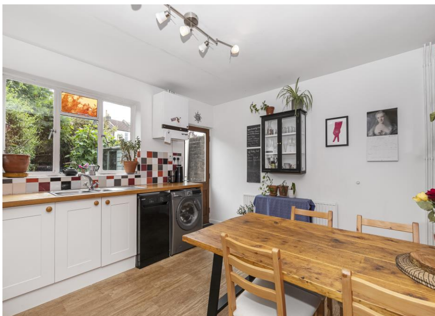
GROUND FLOOR 338 sq.ft. (31.4 sq.m.) approx.