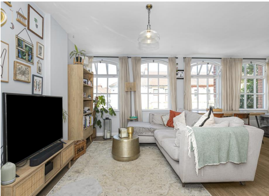
GROUND FLOOR 622 sq. ft. (57.8 sq.m.) approx.