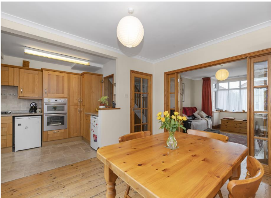
GROUND FLOOR 495 sq.ft. (46.0 sq.m.) approx.