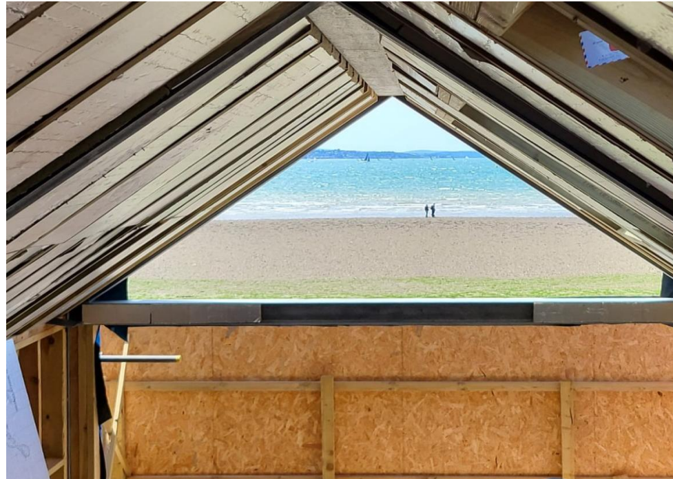
CHALET 34' 7" x 13' 1" (10.54m x 3.99m)