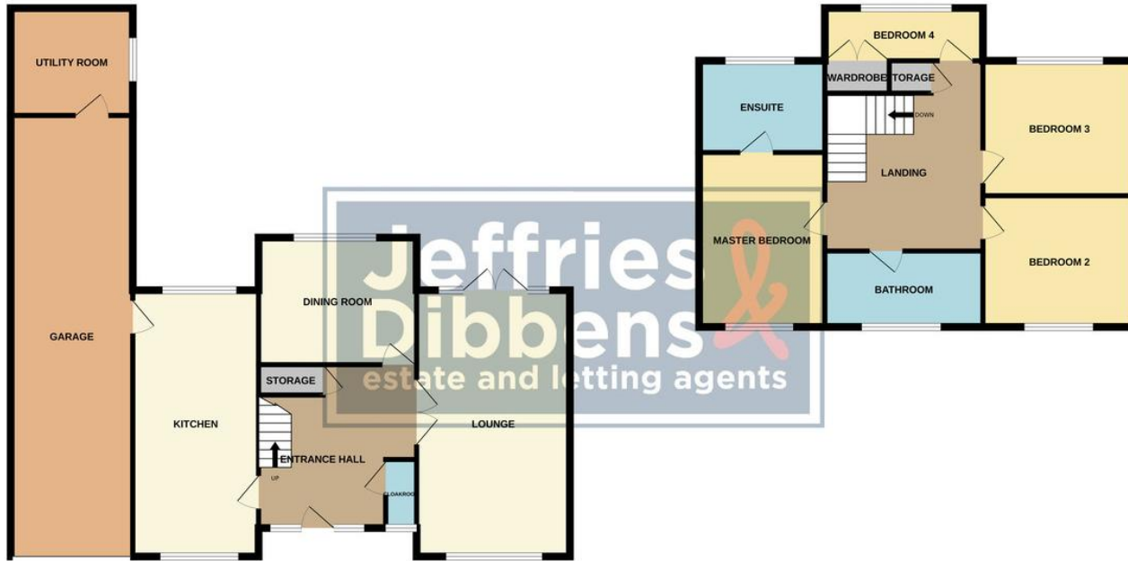
TOTAL FLOOR AREA : 1809 sq.ft. (168.1 sq.m.) approx. Whilst every attempt has been made to ensure the accuracy of the floorplan contained here, measurements of doors, windows, rooms and any other items are approximate and no responsibility is taken for any error.

LOCAL AUTHORITY Fareham Borough Council TENURE Freehold COUNCIL TAX BAND Band F VIEWINGS By prior appointment only