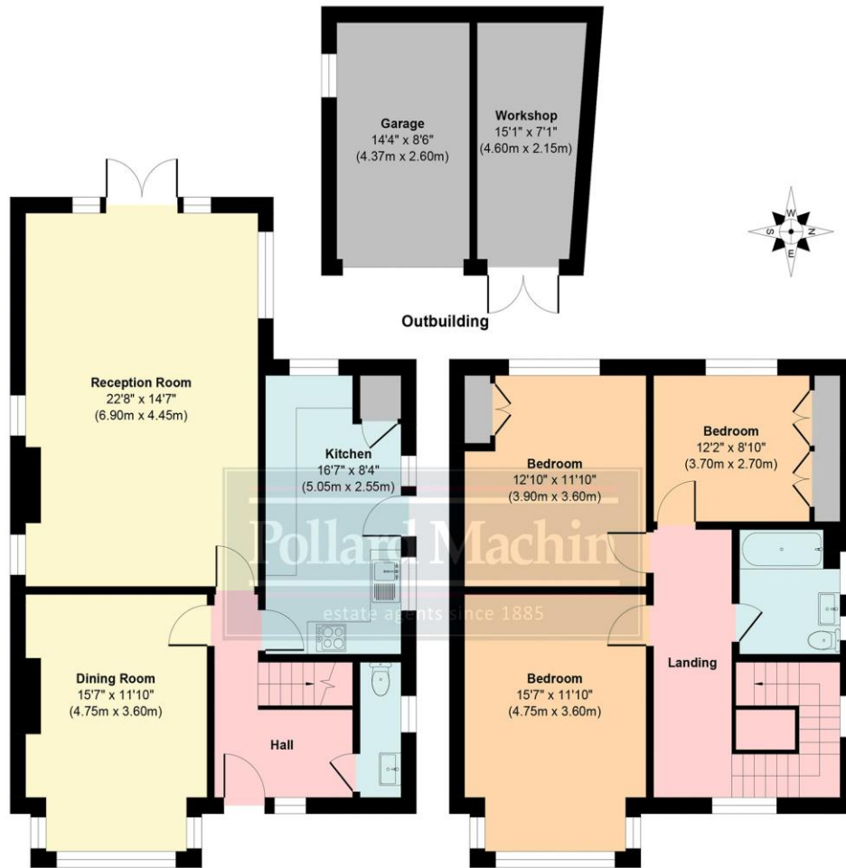
Ground Floor First Floor Sanderstead Court Avenue, South Croydon, CR2 Approx. Gross Internal Area 1421 sq. ft / 132.00 sq. meters

Whilst every attempt has been made to ensure the accuracy of the floorplan shown, all measurements, positioning Fixtures fittings and any other data shown are an approximate interpretation for illustrative purposes only and are not to scale. No responsibility is taken for any errors, omission, miss-statement or use of data show. Plan produced by AR Net Media-www.arnetmedia.uk