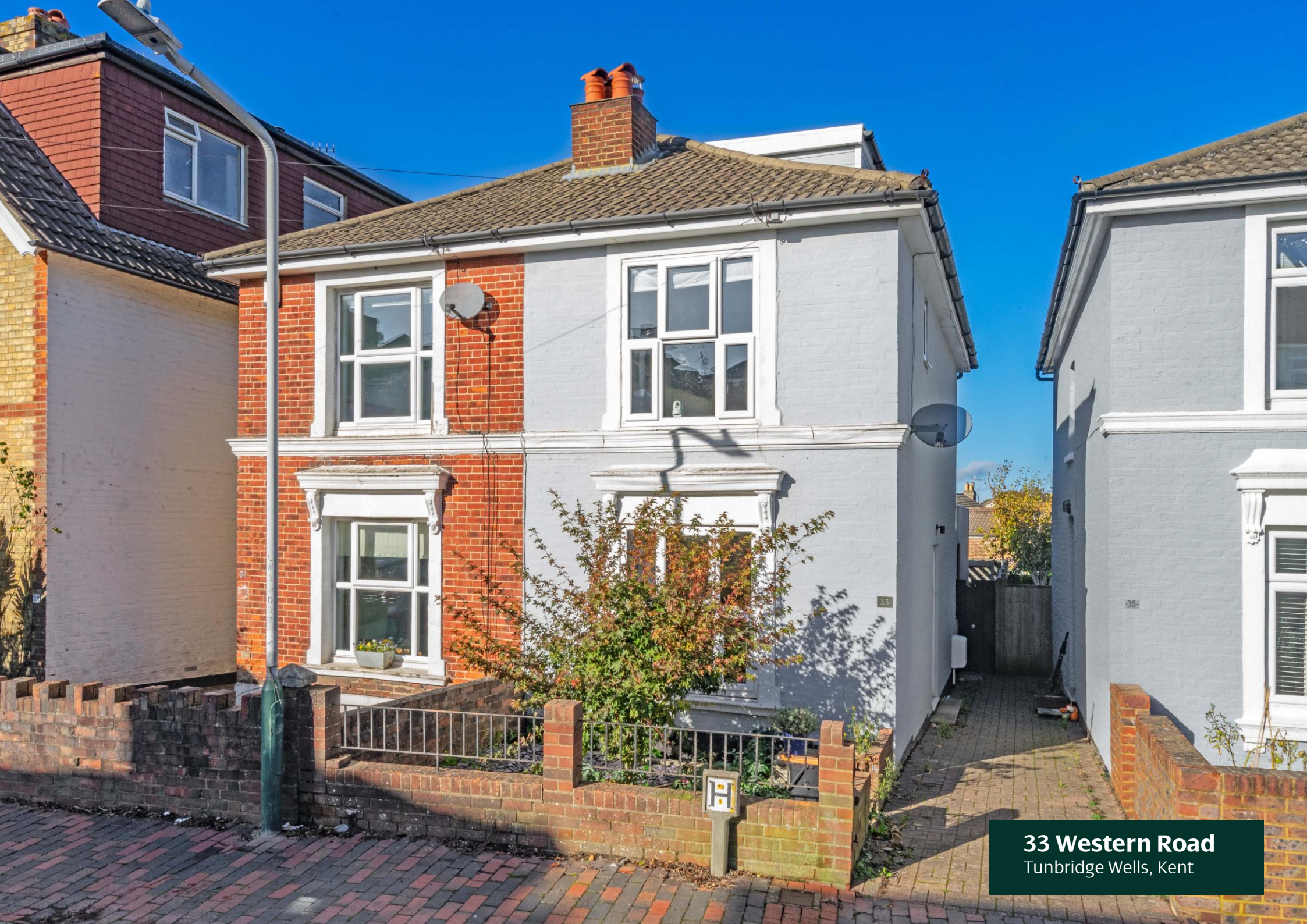
33 Western Road Tunbridge Wells, Kent