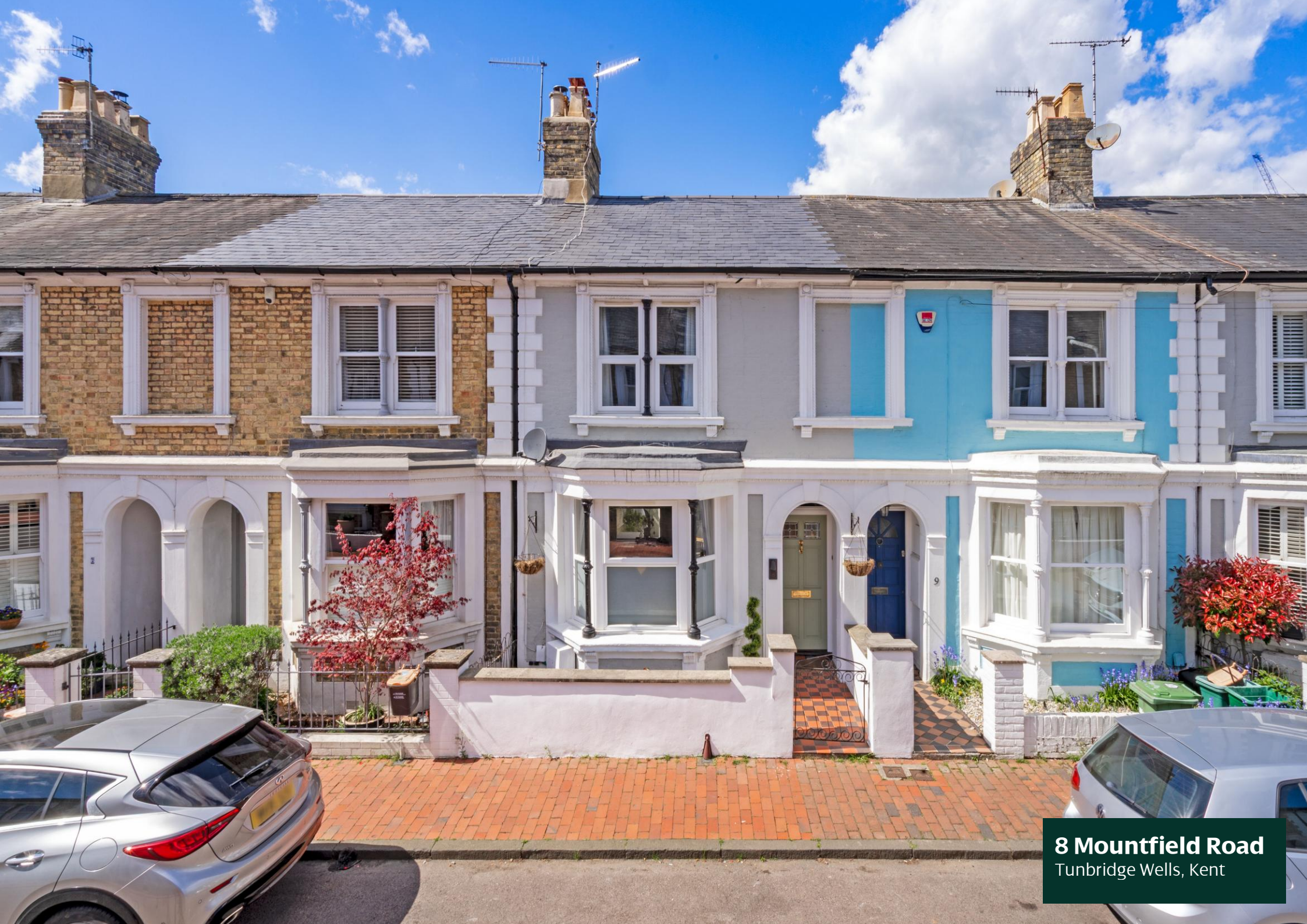
8 Mountfield Road Tunbridge Wells, Kent